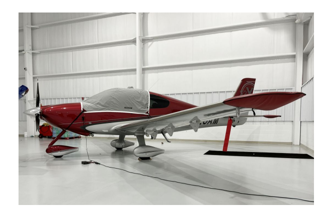
Cirrus SR-22 Cockpit Cover

Designed to prevent damage to the aircraft extremities in crowded hangars, these products are made of bright red Naugahyde and thickly padded with a sandwich of closed cell foam.