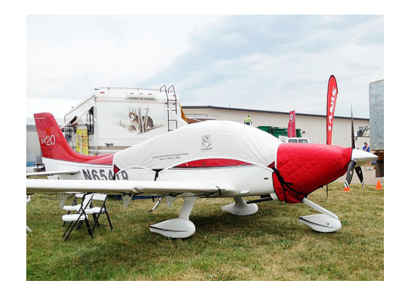
Cirrus SR22 Canopy Cover / Insulated Engine Cover / Wing Covers

This cover type is made from Silver Acrylic Sunbrella canvas and is 100% lined with a soft and smooth microfiber. Bruce's Custom Covers developed this material combination especially for aircraft protection. The outer material is medium weight and treated for water resistance, UV resistance and anti-static buildup. The inner lining is a very soft and smooth microfiber to prevent scratching. The material is very reflective, and tests show that the cabin interior temperature can be reduced to near-ambient temperature on the hottest of days. It is water, ice and snow repellent, yet breathable to allow moisture to escape from between the cover and the aircraft surface.