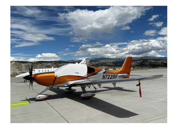
Cirrus SR22 Travel Cover, Light Weight Travel Canopy Cover (Does Not Cirrus SR22 Cockpit Cover, Windshield And Forward Cover Parachute Panel)