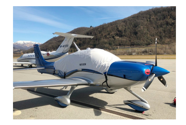
Cirrus Canopy Cover snd Engine Inlet Plugs