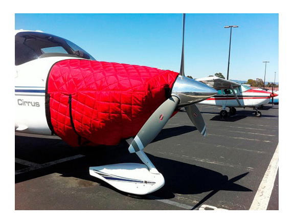
Cirrus SR22 Insulated Engine Cover