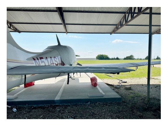
Cirrus SR-22 Canopy, Wing & Wheelpant Covers