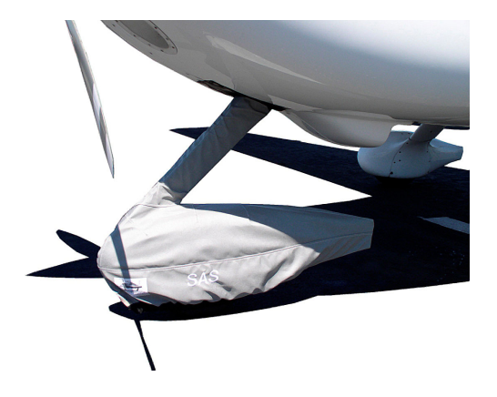
Cirrus Front Wheelpant/Strut Cover