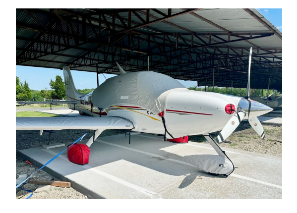
Cirrus SR-22 Wheelpant Covers