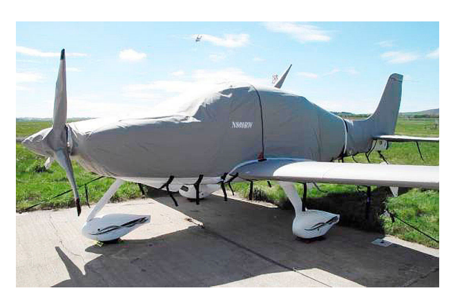
Cirrus SR20 Full Cover Set: Prop, Extended Canopy/Engine, Empennage, Wing Covers