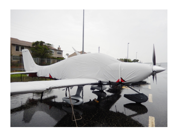
Cirrus SR-22 Complete Cover Set