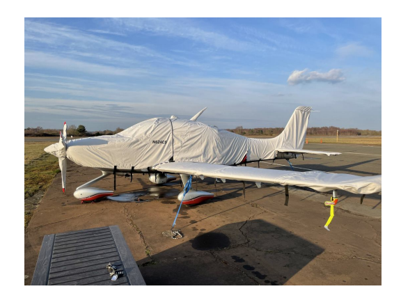
Cirrus SR20 Empennage Cover (covers tail boom, vertical and horizontal stabilizers)