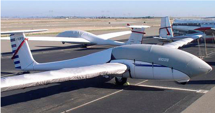
Grob 103 Canopy/Nose & Wing Covers

This cover type is made from Silver Acrylic Sunbrella canvas and is 100% lined with a soft and smooth microfiber. Bruce's Custom Covers developed this material combination especially for aircraft protection. The outer material is medium weight and treated for water resistance, UV resistance and anti-static buildup. The inner lining is a very soft and smooth microfiber to prevent scratching. The material is very reflective, and tests show that the cabin interior temperature can be reduced to near-ambient temperature on the hottest of days. It is water, ice and snow repellent, yet breathable to allow moisture to escape from between the cover and the aircraft surface.