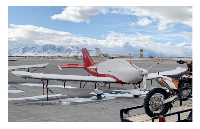
Czech Sport Travel Light Weight Canopy/Engine Cover, Wing Locker Covers