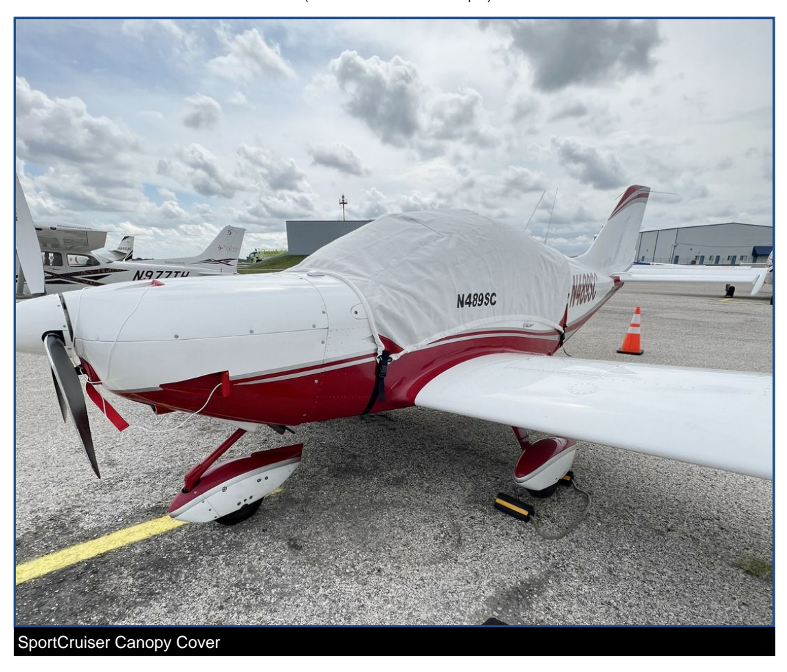
Section 1: Canopy/Cockpit/Fuselage Covers

Canopy Covers help reduce damage to your airplane's upholstery and avionics caused by excessive heat, and they can eliminate problems caused by leaking door and window seals. They keep the windshield and window surfaces clean and help prevent vandalism and theft.