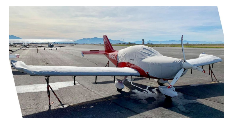
Czech Sport Canopy/Engine & Wing Covers

This cover type is made from Silver Acrylic Sunbrella canvas and is 100% lined with a soft and smooth microfiber. Bruce's Custom Covers developed this material combination especially for aircraft protection. The outer material is medium weight and treated for water resistance, UV resistance and anti-static buildup. The inner lining is a very soft and smooth microfiber to prevent scratching. The material is very reflective, and tests show that the cabin interior temperature can be reduced to near-ambient temperature on the hottest of days. It is water, ice and snow repellent, yet breathable to allow moisture to escape from between the cover and the aircraft surface.