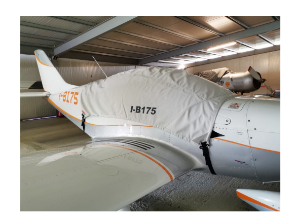
CZAW Sportcruiser Canopy Cover