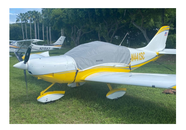
SportCruiser Travel Canopy Cover