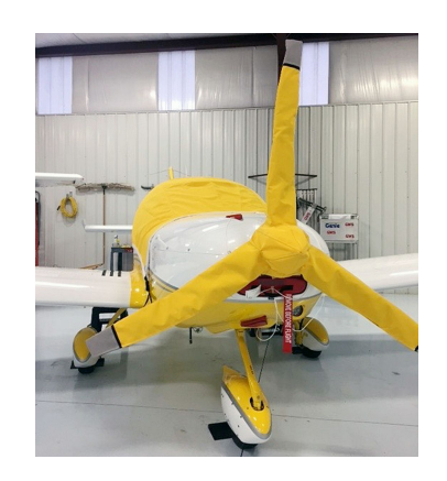
Custom Yellow Canopy Cover, Prop/Spinner, and Inlet Plugs