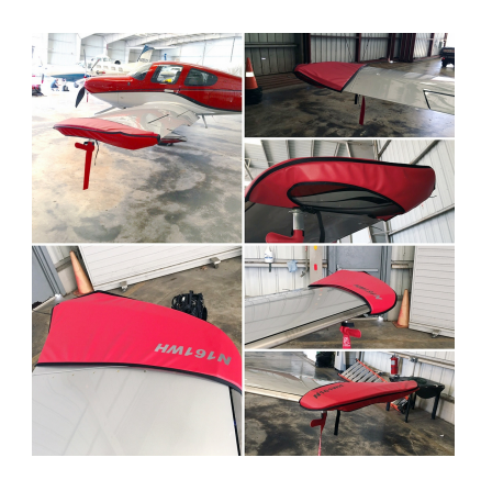
Cirrus SR22 Wingtip Pads, G5 Models

Designed to prevent damage to the aircraft extremities in crowded hangars, these products are made of bright red Naugahyde and thickly padded with a sandwich of closed cell foam.