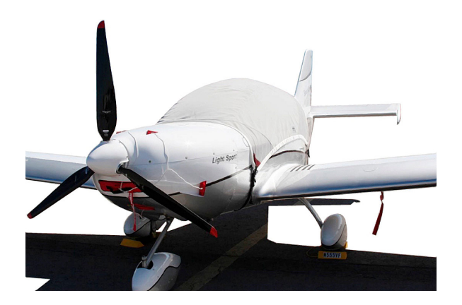
Sportcruiser Canopy Cover & Plugs

Travel Covers are made with Silver Solution-Dyed Polyester fabric and only lined over the windshield to save weight. The material is lightweight and more compact for easy stowage in the aircraft. The polyester material is water resistant, but only intended for occasional use outside. We also have an ultra lightweight material available for fitted hangar dust covers. For daily outdoor use, the non-travel Sunbrella Cover is the best choice.