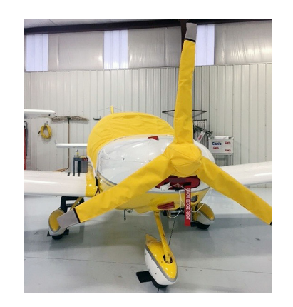
Custom Yellow Canopy Cover, Prop/Spinner, and Inlet Plugs