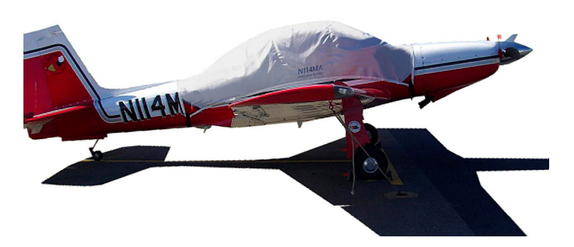
Micco SP20 Canopy Cover & Engine Inlet Plugs