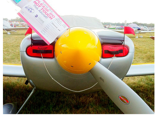
Vans's RV-7 Engine Engine Inlet Plugs