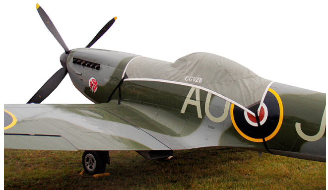
Supermarine Spitfire Mark 16 Canopy Cover