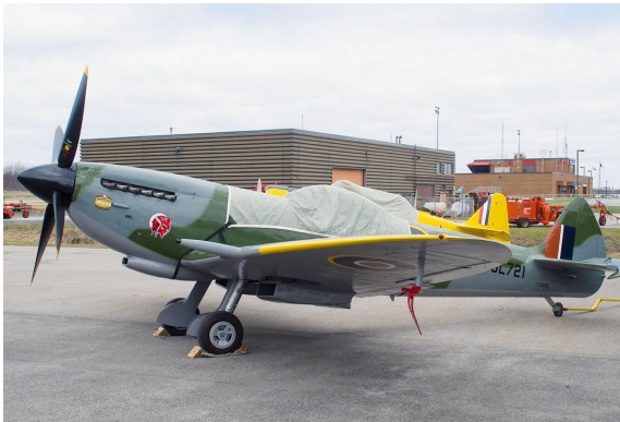
Supermarine Spitfire Mk 14 Canopy Cover

Travel Covers are made with Silver Solution-Dyed Polyester fabric and only lined over the windshield to save weight. The material is lightweight and more compact for easy stowage in the aircraft. The polyester material is water resistant, but only intended for occasional use outside. We also have an ultra lightweight material available for fitted hangar dust covers. For daily outdoor use, the non-travel Sunbrella Cover is the best choice.