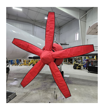
Fairchild Metro 5 Blade Insulated Insulated Prop Covers

This cover type is made from Silver Acrylic Sunbrella canvas and is 100% lined with a soft and smooth microfiber. Bruce's Custom Covers developed this material combination especially for aircraft protection. The outer material is medium weight and treated for water resistance, UV resistance and anti-static buildup. The inner lining is a very soft and smooth microfiber to prevent scratching. The material is very reflective, and tests show that the cabin interior temperature can be reduced to near-ambient temperature on the hottest of days. It is water, ice and snow repellent, yet breathable to allow moisture to escape from between the cover and the aircraft surface.