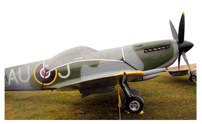
Supermarine Spitfire Mark 16 Canopy Cover