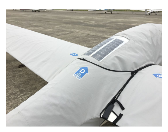
DG-505 Full Cover Set