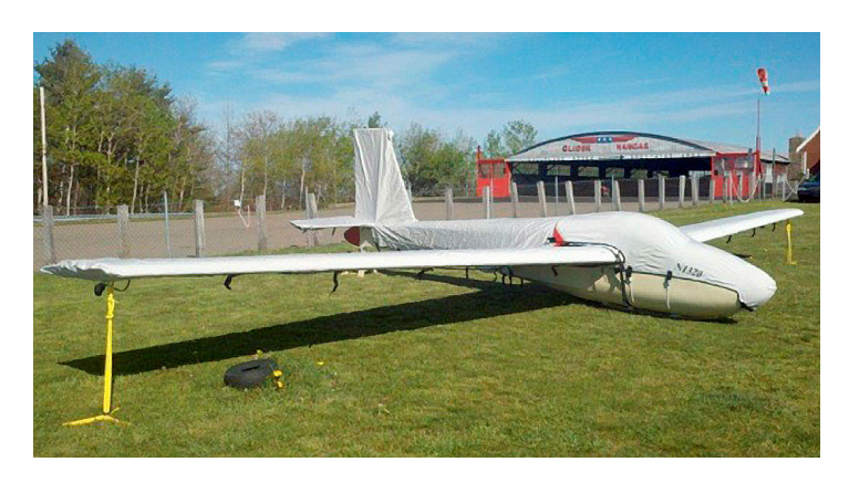
Schweizer 1-26B Canopy/Nose, Empennage & Wing Covers