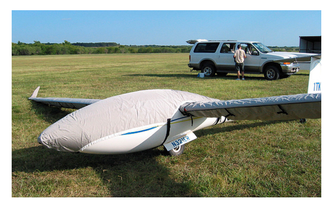
Canopy/Nose Cover, Wings and Horizontal Stab Covers