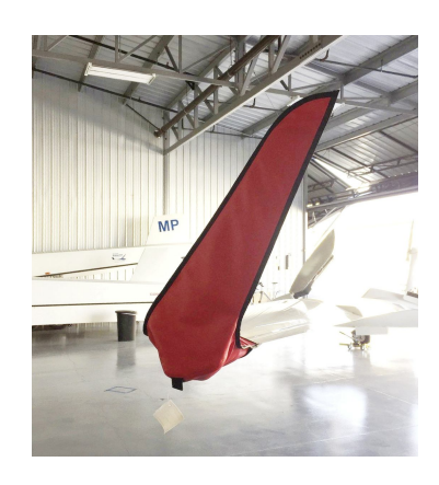
Schleicher ASH Wingtip Pads