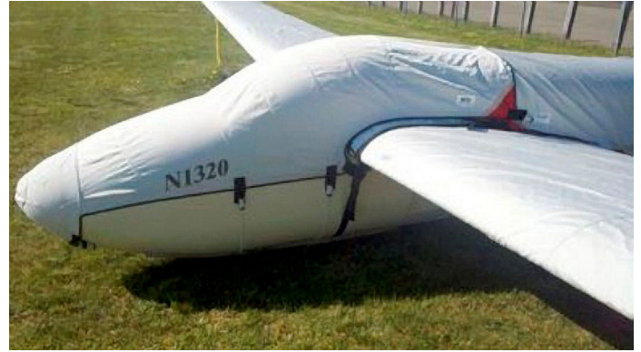
Schweizer 1-26B Canopy/Nose, Empennage & Wing Covers Schweizer SGS 1-26B Canopy/Nose, Wings & Empennage Covers