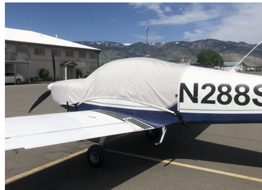
Sling 2 Canopy/Engine Cover