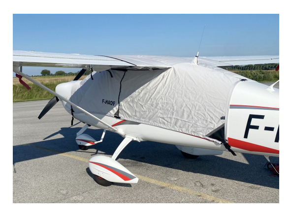
Tecnam P2010 Over-Top Canopy Cover