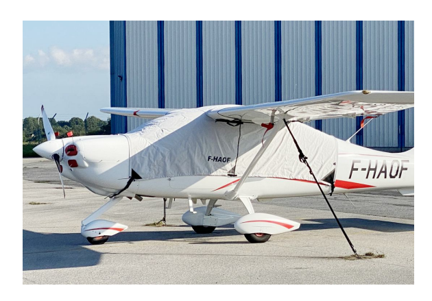
Tecnam P2010 Over-Top Canopy Cover, Engine Plugs