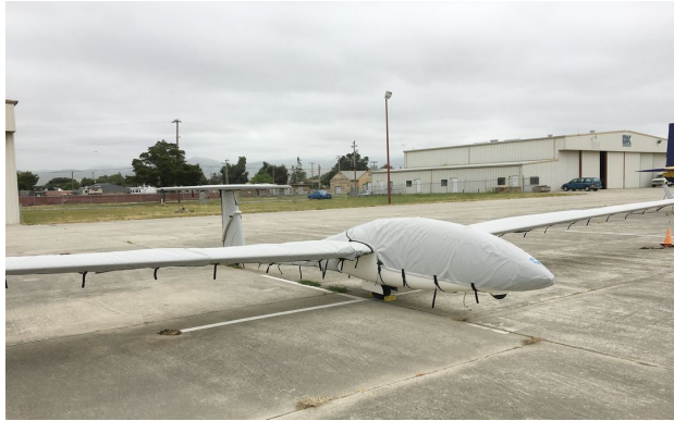
DG-505 Canopy/Nose, Wing, Empennage & Horiz. Stab. Covers

WINTER USE MATERIAL - Made with Solution-Dyed Polyester fabric, this option is intended for seasonal use to aid in deicing, rain mitigation, or for occasional travel. The material is lighter and more compact, but more susceptible to UV damage and may have a shorter useful life if used continuously outside than the all-year use material.