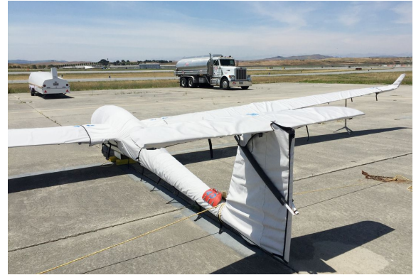
Schempp-Hirth Discus 2B Full Cover Set