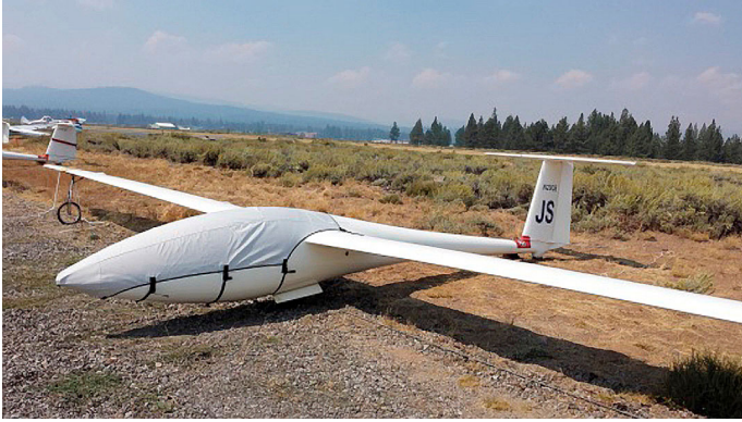
ASW-20C Canopy/Nose Cover

The material is very reflective, and tests show that the cabin interior temperature can be reduced to near-ambient temperature on the hottest of days. It is water, ice and snow repellent, yet breathable to allow moisture to escape from between the cover and the aircraft surface.