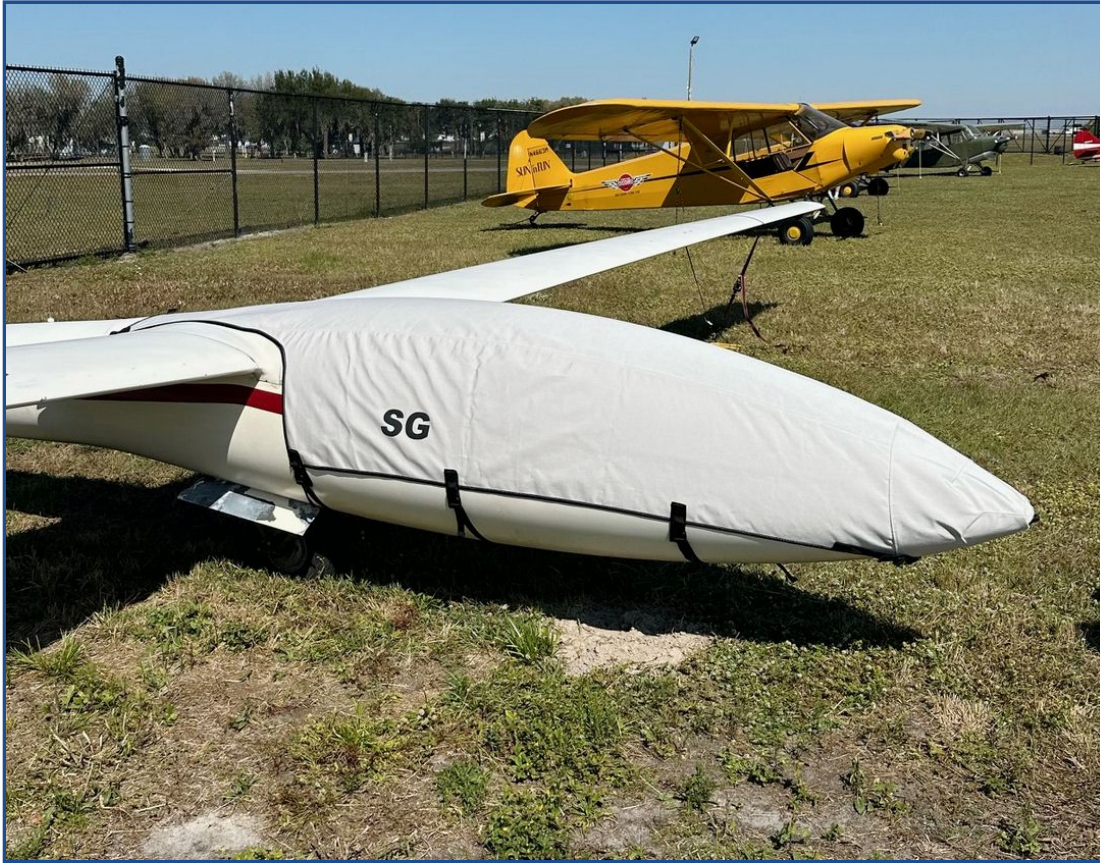
Schreder HP-18 Canopy/Nose Cover