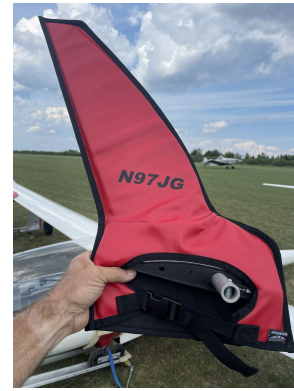
Schempp-Hirth Ventus-2B winglet/wingtip pads