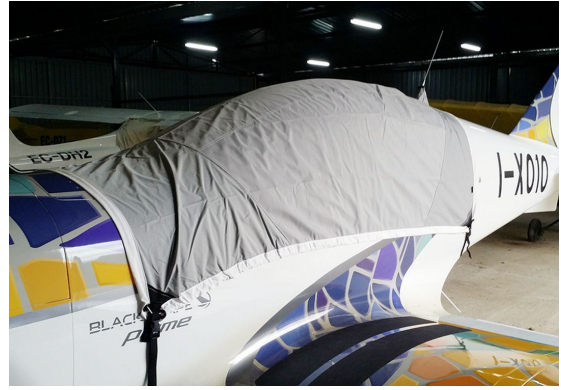
Blackshape Prime Travel Cover, Light Weight Travel Canopy Cover