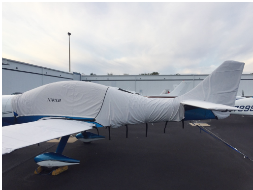
Lancair ES Wing Covers & Empennage Cover (sold separately)

This cover type is made from Silver Acrylic Sunbrella canvas and is 100% lined with a soft and smooth microfiber. Bruce's Custom Covers developed this material combination especially for aircraft protection. The outer material is medium weight and treated for water resistance, UV resistance and anti-static buildup. The inner lining is a very soft and smooth microfiber to prevent scratching. The material is very reflective, and tests show that the cabin interior temperature can be reduced to near-ambient temperature on the hottest of days. It is water, ice and snow repellent, yet breathable to allow moisture to escape from between the cover and the aircraft surface.