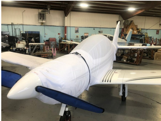
Shark 600 Complete Cover Set, test fit

WINTER USE MATERIAL - Made with Solution-Dyed Polyester fabric, this option is intended for seasonal use to aid in deicing, rain mitigation, or for occasional travel. The material is lighter and more compact, but more susceptible to UV damage and may have a shorter useful life if used continuously outside than the all-year use material.