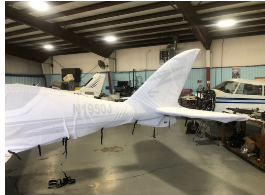
Shark 600 Complete Cover Set, test fit