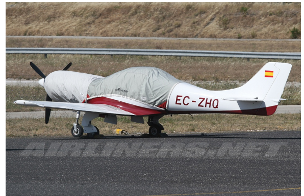
Lancair 360 Canopy Cover, Engine Cover