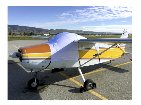
Bolkow Junior 208 Canopy Cover (test fit)