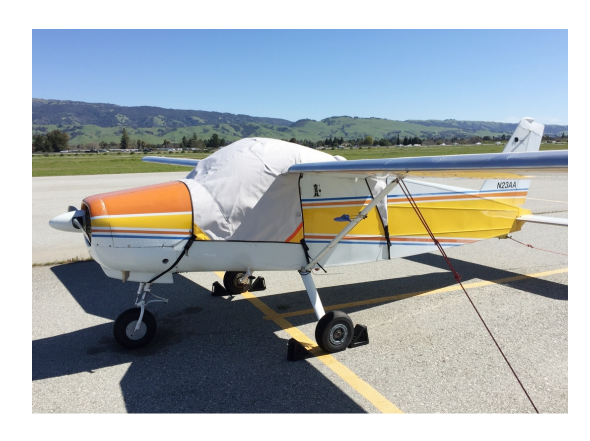
Bolkow Junior 208 Canopy Cover