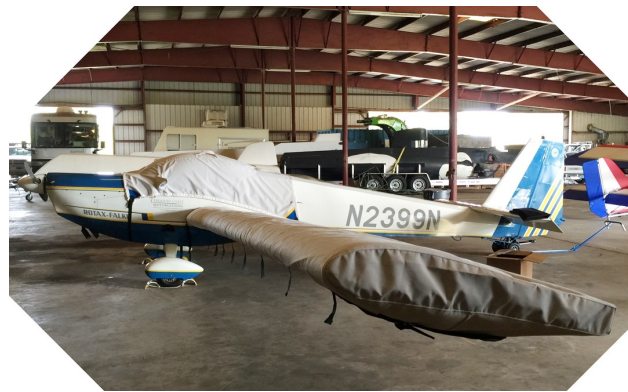
Scheibe Falke SF25 Canopy & Wing Covers