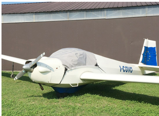
Motorfalke SF25 Lightweight Travel Canopy Cover