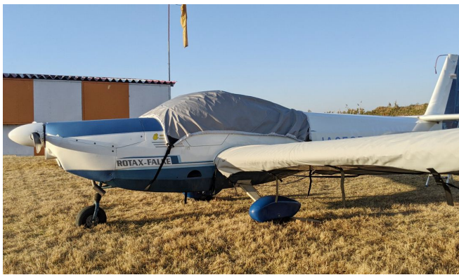
Falke SF-25 C Light Weight Travel Canopy Cover