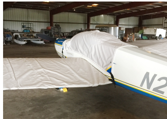
Scheibe Falke SF25 Canopy & Wing Covers