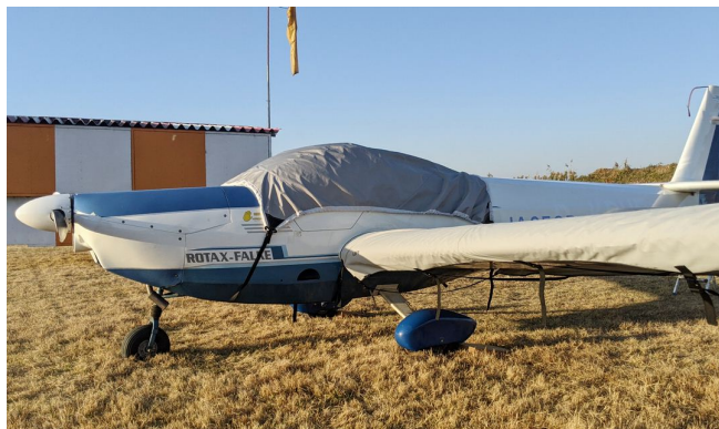
Falke SF-25 C Light Weight Travel Canopy Cover