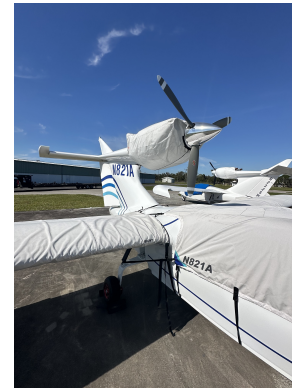
Seawind Seawind 300C & 3000 Amphibian Wing Covers, All Year Use