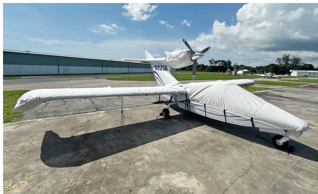
Seawind 3000 Canopy/Nose, Wing & Engine Covers

This cover type is made from Silver Acrylic Sunbrella canvas and is 100% lined with a soft and smooth microfiber. Bruce's Custom Covers developed this material combination especially for aircraft protection. The outer material is medium weight and treated for water resistance, UV resistance and anti-static buildup. The inner lining is a very soft and smooth microfiber to prevent scratching. The material is very reflective, and tests show that the cabin interior temperature can be reduced to near-ambient temperature on the hottest of days. It is water, ice and snow repellent, yet breathable to allow moisture to escape from between the cover and the aircraft surface.