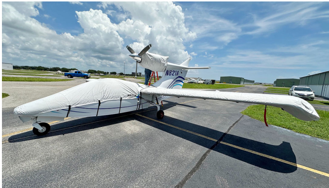
Seawind 3000 Canopy/Nose, Wing & Engine Covers

WINTER USE MATERIAL - Made with Solution-Dyed Polyester fabric, this option is intended for seasonal use to aid in deicing, rain mitigation, or for occasional travel. The material is lighter and more compact, but more susceptible to UV damage and may have a shorter useful life if used continuously outside than the all-year use material.