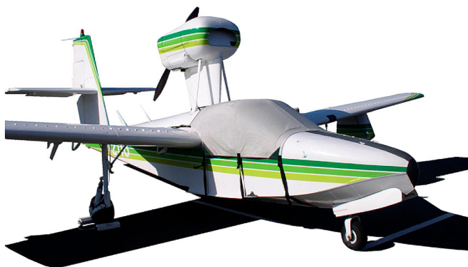
Lake LA-250 Canopy Cover