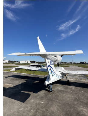
Seawind Seawind 300C & 3000 Amphibian Wing Covers, All Year Use