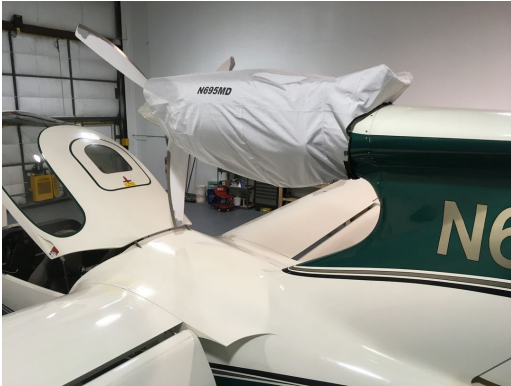
Seawind 3000 Custom Engine Cover

This cover type is made from Silver Acrylic Sunbrella canvas and is 100% lined with a soft and smooth microfiber. Bruce's Custom Covers developed this material combination especially for aircraft protection. The outer material is medium weight and treated for water resistance, UV resistance and anti-static buildup. The inner lining is a very soft and smooth microfiber to prevent scratching. The material is very reflective, and tests show that the cabin interior temperature can be reduced to near-ambient temperature on the hottest of days. It is water, ice and snow repellent, yet breathable to allow moisture to escape from between the cover and the aircraft surface.