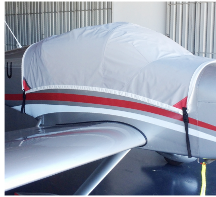
Vans's RV-9 Light Weight Travel Canopy Cover