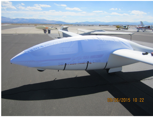
DG-505 Canopy/Nose Cover (test fit cover)