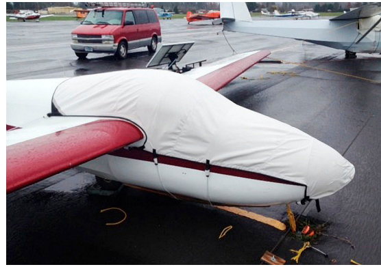
SGS 1-26B Canopy/Nose Cover