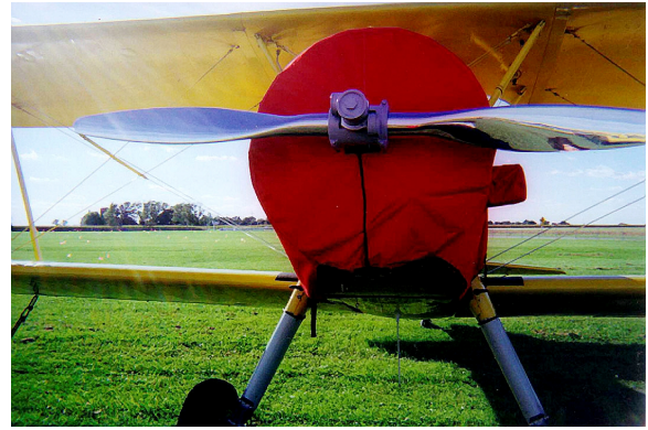
Stearman Engine Cover