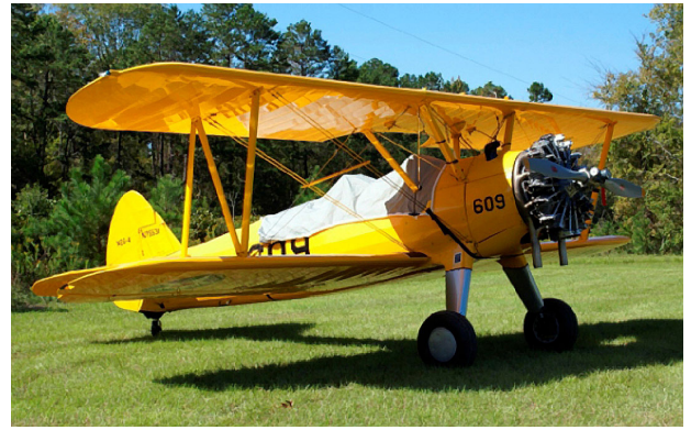
Stearman Canopy Cover