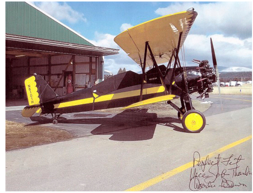
Stearman C3 Canopy Cover