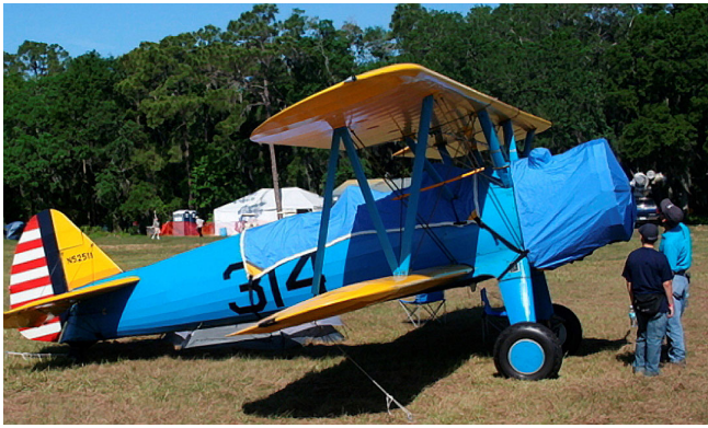
Stearman Canopy & Engine Covers