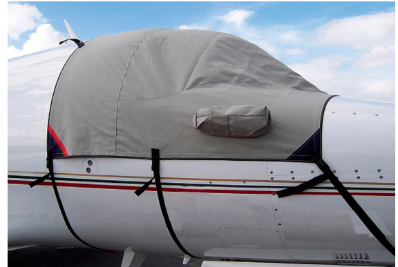
Sabre Cockpit Cover