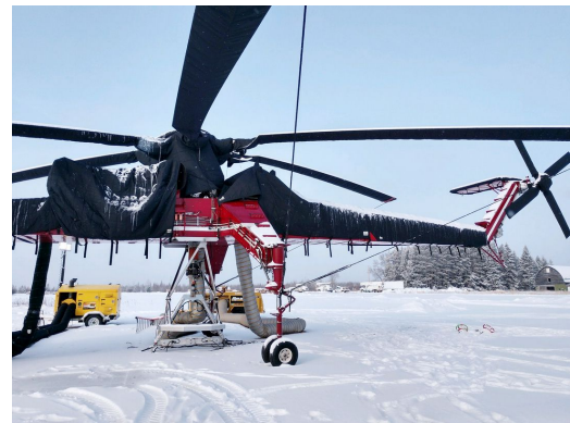
Sikorsky S-64 Canopy/Nose, Engine Area, Blade, Rotor, Tail Rotor Sikorsky S-64 Skycrane, CH-54 Tarhe Insulated Engine, Rotor Hub, Tailboom, Stabilizer & Tail Rotor Covers Sikorsky S-64 Skycrane, CH-54 Tarhe Insulated Engine, Rotor Hub, Tailboom, Stabilizer & Tail Rotor Covers