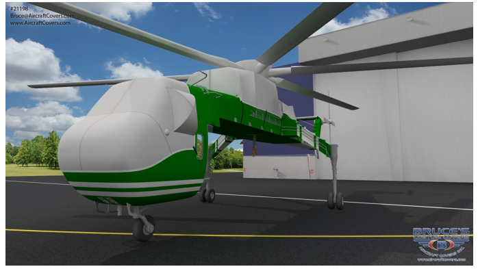
Sikorsky S-64 Skycrane, CH-54 Tarhe Insulated Engine, Rotor Sikorsky S-64 Canopy/Nose, Engine Area, Blade, Rotor, Tail Rotor Hub, Tailboom, Stabilizer & Tail Rotor Covers Sikorsky S-64 Canopy/Nose, Engine Area, Blade, Rotor, Tail Rotor Covers (illustration)