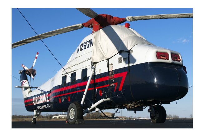
Sikorsky S58T Canopy, Rotor Hub, Blade, Tail Rotor Covers, Engine Plugs, Blade Tie-Downs