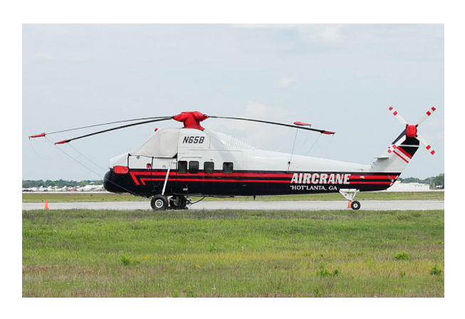
S58 Cockpit Windshield, Main Rotor, Particle Separator, Exhaust Covers, Intake Plugs and Blade Tie-downs