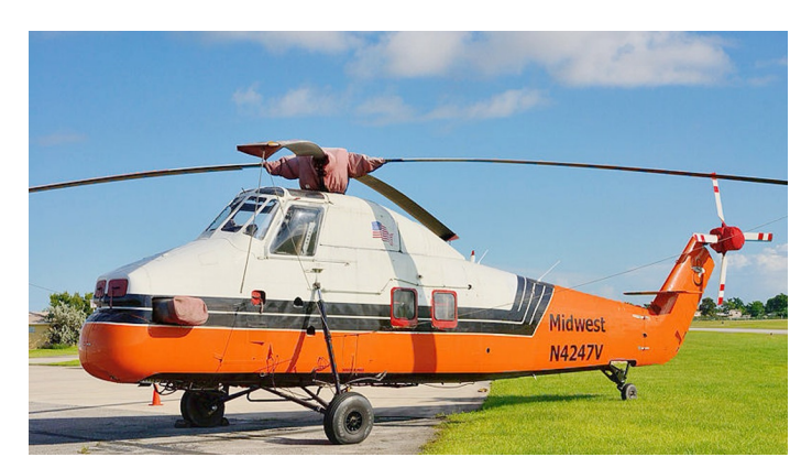
Sikorsky S58T Rotor Hub, Tail Rotor Hub, Engine Plugs, Blade Tie-Downs

The Engine Inlet Plugs are custom fit for your Sikorsky S58T intakes, made with heavy-duty vinyl material, and stuffed with a single block of sculpted urethane foam. Each plug has a zipper that allows the foam to be removed and dried if necessary. Engine plugs have 'Remove Before Flight' streamers sewn onto the face of the plugs. Most plugs are imprinted with the aircraft registration number in black for an extra charge. Storage bag NOT included. Engine plugs may be inserted after flight when the engine is still warm. Engine Inlet Plugs are commonly referred to as Cowl Plugs, Intake Plugs, Cowl Blocks, Engine Blocks, and Engine Bungs.