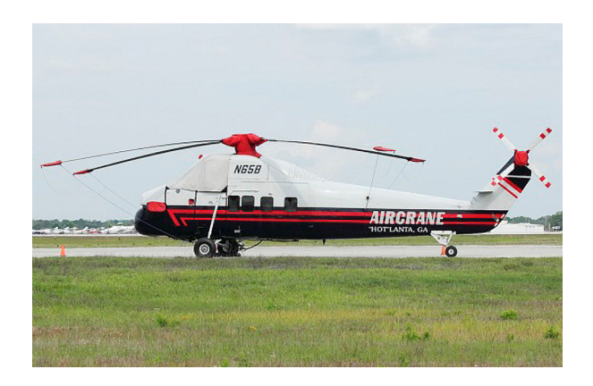
Sikorsky S58T Rotor Hub, Tail Rotor Hub, Engine Plugs, Blade S58 Cockpit Windshield, Main Rotor, Particle Separator, Exhaust Tie-Downs Covers, Intake Plugs and Blade Tie-downs