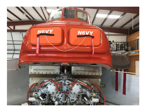
Sikorsky S58T Engine Inlet Plugs