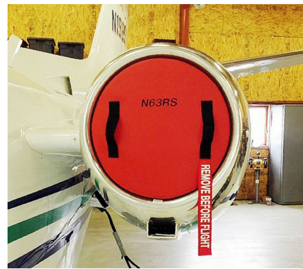
Cessna Citation S-550 Intake Plugs