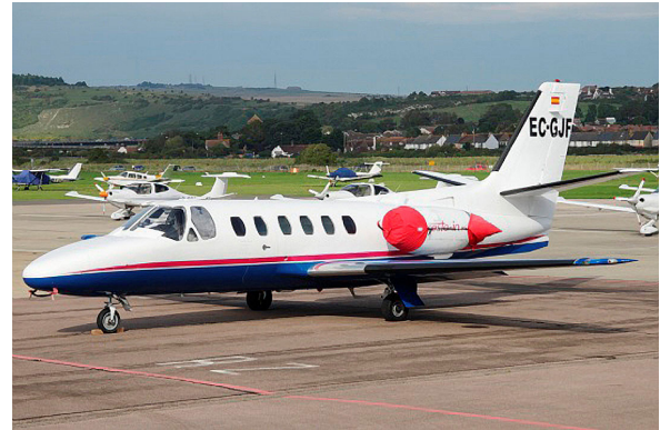
Cessna Citation II Engine Covers, Pitot Covers