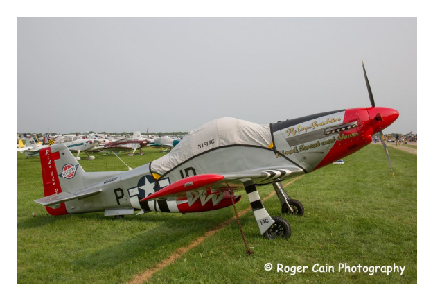
Titan Mustang Canopy Cover

Covers developed this material combination especially for aircraft protection. The outer material is medium weight and treated for water resistance, UV resistance and anti-static buildup. The inner lining is a very soft and smooth microfiber to prevent scratching. The material is very reflective, and tests show that the cabin interior temperature can be reduced to near-ambient temperature on the hottest of days. It is water, ice and snow repellent, yet breathable to allow moisture to escape from between the cover and the aircraft surface.