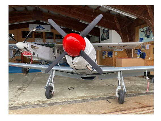
SW-51 Mustang Engine Cover

This cover type is made from Silver Acrylic Sunbrella canvas and is 100% lined with a soft and smooth microfiber. Bruce's Custom Covers developed this material combination especially for aircraft protection. The outer material is medium weight and treated for water resistance, UV resistance and anti-static buildup. The inner lining is a very soft and smooth microfiber to prevent scratching. The material is very reflective, and tests show that the cabin interior temperature can be reduced to near-ambient temperature on the hottest of days. It is water, ice and snow repellent, yet breathable to allow moisture to escape from between the cover and the aircraft surface.