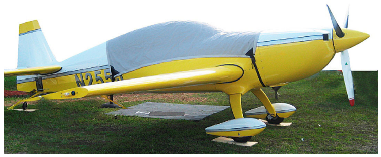
Extra 300L Canopy Cover