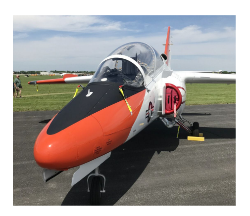
Siai Marchetti S-211 Intake Plugs