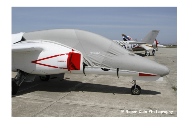
S-211 Canopy/Nose Cover & Engine Plugs