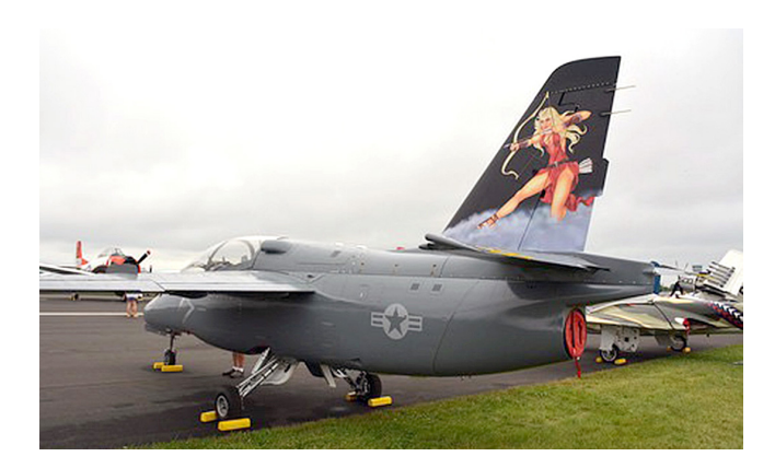
Siai Marchetti S-211 Exhaust Plug

The Engine Inlet Plugs are custom fit for your Siai Marchetti S-211 intakes, made with heavy-duty vinyl material, and stuffed with a single block of sculpted urethane foam. Each plug has a zipper that allows the foam to be removed and dried if necessary. Engine plugs have 'remove before flight' streamers sewn onto the face of the plugs. Most plugs are imprinted with the aircraft registration number in black for an extra charge. Storage bag NOT included. Engine plugs may be inserted after flight when the engine is still warm. Engine Inlet Plugs are commonly referred to as Cowl Plugs, Intake Plugs, Cowl Blocks, Engine Blocks, and Engine Bungs.