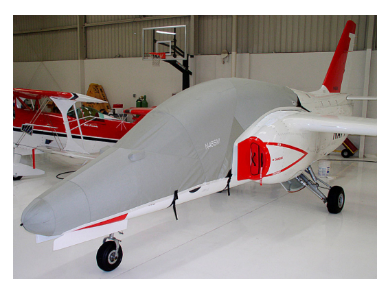
S-211 Canopy/Nose Cover & Engine Plugs