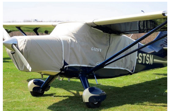
Stinson 108 Canopy & Engine Cover