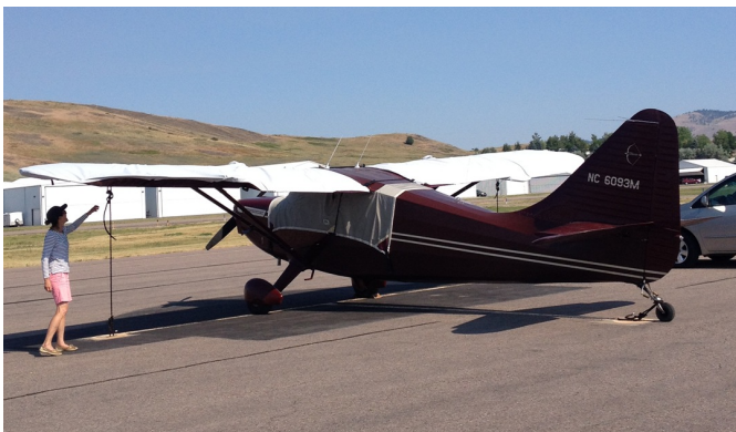
Stinson 108 Canopy Cover & Wing Covers

This cover type is made from Silver Acrylic Sunbrella canvas and is 100% lined with a soft and smooth microfiber. Bruce's Custom Covers developed this material combination especially for aircraft protection. The outer material is medium weight and treated for water resistance, UV resistance and anti-static buildup. The inner lining is a very soft and smooth microfiber to prevent scratching. The material is very reflective, and tests show that the cabin interior temperature can be reduced to near-ambient temperature on the hottest of days. It is water, ice and snow repellent, yet breathable to allow moisture to escape from between the cover and the aircraft surface.