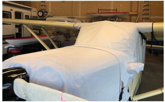
Stinson 108 Over-Top Canopy Cover, Engine Cover