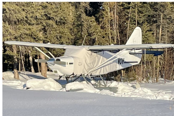
Stinson 108 Extended Canopy Cover, Wing Covers