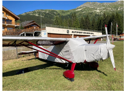
Stinson 108-3 Voyager Cover Set