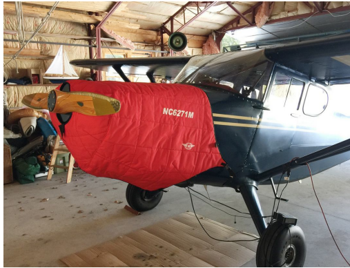
Stinson 108 Insulated Engine Cover

This cover type is made from Silver Acrylic Sunbrella canvas and is 100% lined with a soft and smooth microfiber. Bruce's Custom Covers developed this material combination especially for aircraft protection. The outer material is medium weight and treated for water resistance, UV resistance and anti-static buildup. The inner lining is a very soft and smooth microfiber to prevent scratching. The material is very reflective, and tests show that the cabin interior temperature can be reduced to near-ambient temperature on the hottest of days. It is water, ice and snow repellent, yet breathable to allow moisture to escape from between the cover and the aircraft surface.