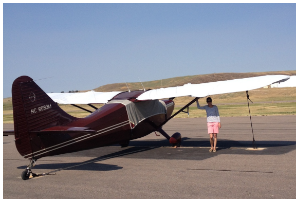
Stinson 108 Canopy Cover & Wing Covers

WINTER USE MATERIAL - Made with Solution-Dyed Polyester fabric, this option is intended for seasonal use to aid in deicing, rain mitigation, or for occasional travel. The material is lighter and more compact, but more susceptible to UV damage and may have a shorter useful life if used continuously outside than the all-year use material.