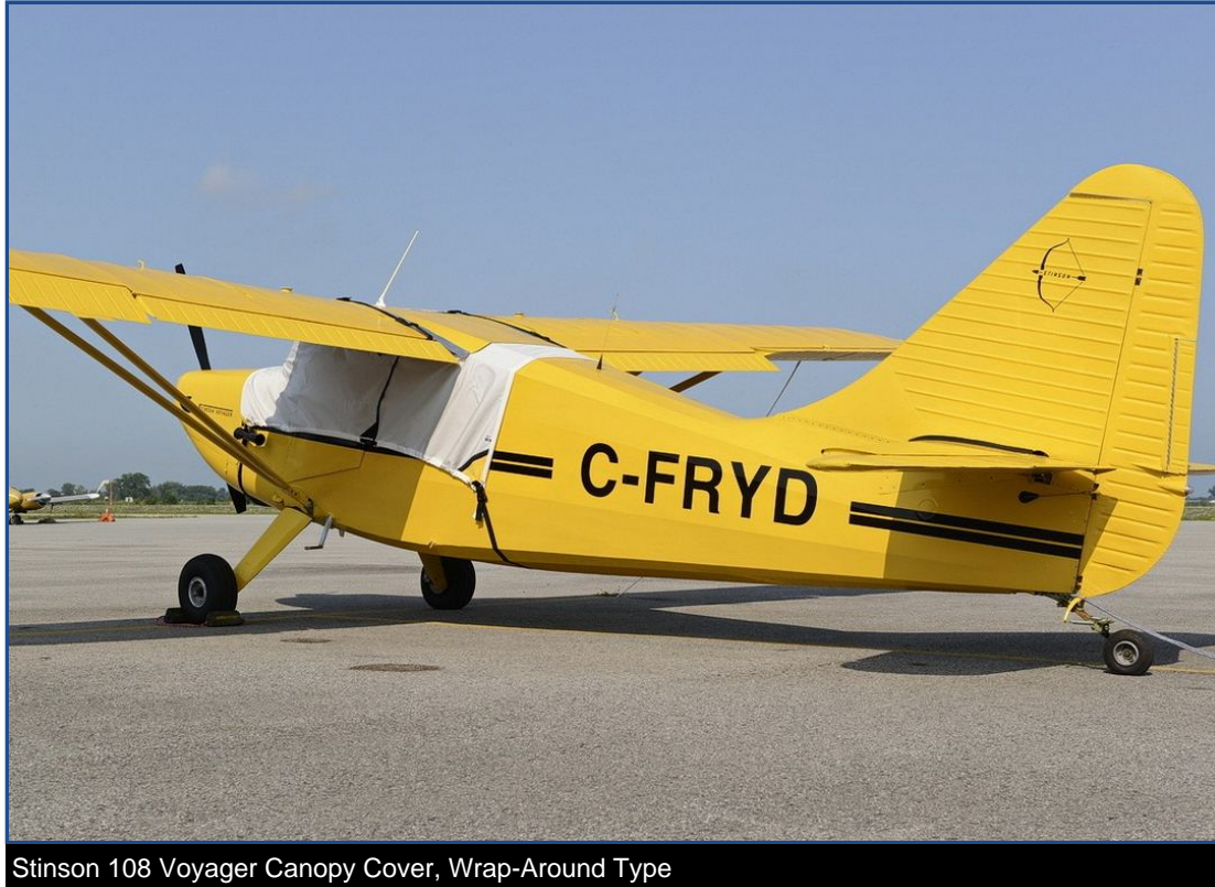
Stinson 108 Voyager Canopy Cover, Wrap-Around Type