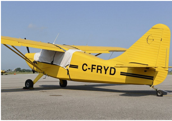
Stinson 108 Voyager Canopy Cover, Wrap-Around Type