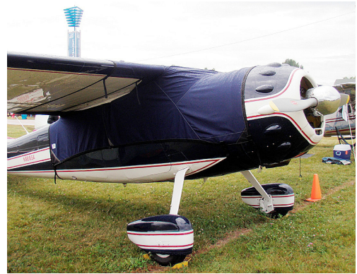
Cessna 195 Canopy Cover, extended forward and over gas caps