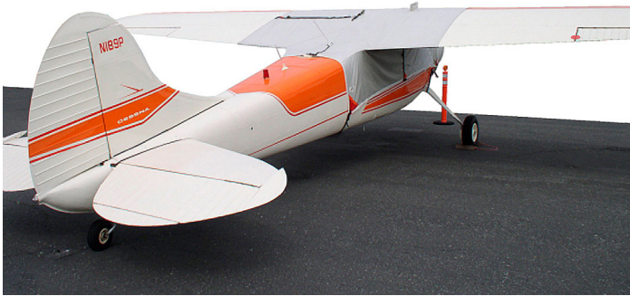
Cessna 195 Over-Top Canopy, Engine & Prop Covers

The material is very reflective, and tests show that the cabin interior temperature can be reduced to near-ambient temperature on the hottest of days. It is water, ice and snow repellent, yet breathable to allow moisture to escape from between the cover and the aircraft surface.