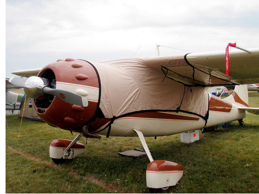
Cessna 195 Canopy Cover, extended forward and over gas caps Cessna 195 Canopy Cover, extended forward and over gas caps