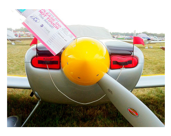
Vans's RV-7 Engine Engine Inlet Plugs