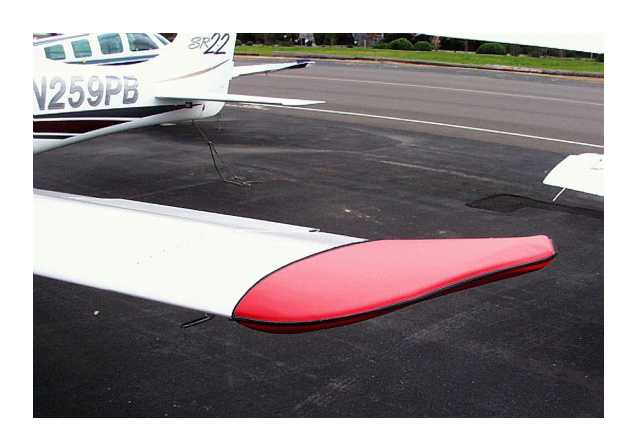
Cirrus SR-22 Wingtip Pad (also available for the Horiz. Stab.