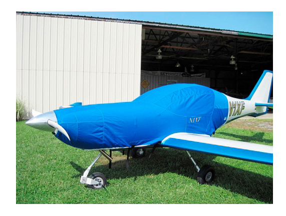
Arion Lightning Extended Canopy/Engine Cover

This cover type is made from Silver Acrylic Sunbrella canvas and is 100% lined with a soft and smooth microfiber. Bruce's Custom Covers developed this material combination especially for aircraft protection. The outer material is medium weight and treated for water resistance, UV resistance and anti-static buildup. The inner lining is a very soft and smooth microfiber to prevent scratching. The material is very reflective, and tests show that the cabin interior temperature can be reduced to near-ambient temperature on the hottest of days. It is water, ice and snow repellent, yet breathable to allow moisture to escape from between the cover and the aircraft surface.