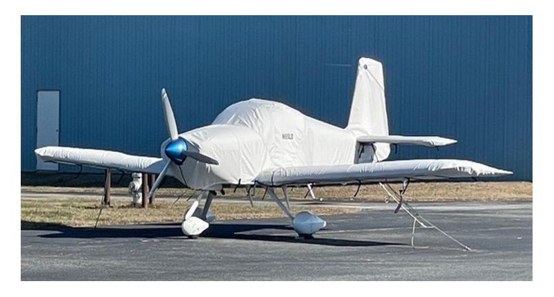
RV9-A Hail Protection Complete Cover Set