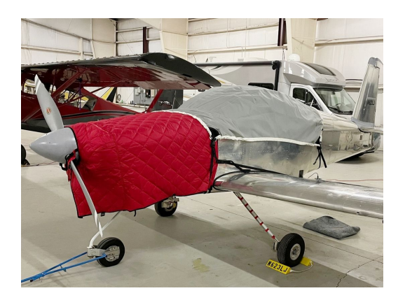
Vans RV-7 Travel Canopy Cover, Hangar Blanket