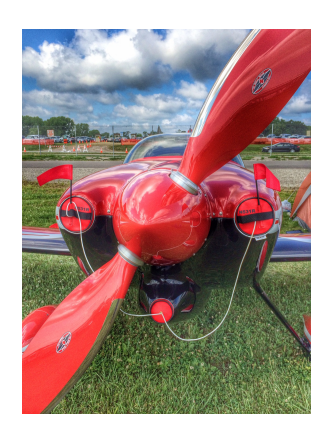
Van's RV-7 Engine Inlet Plugs