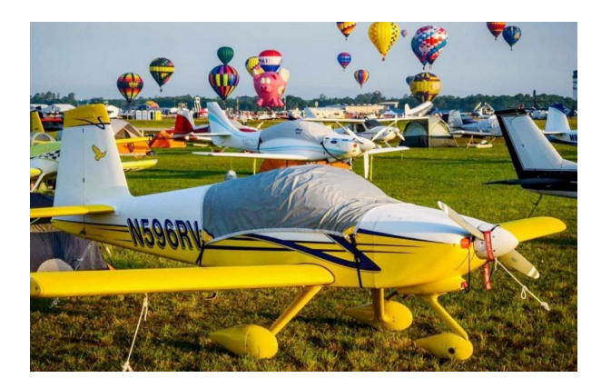
Vans's RV-9 Travel Weight Canopy Cover at Sun 'n Fun