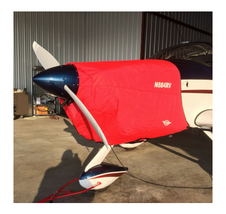
Van's RV-9A Insulated Engine Cover