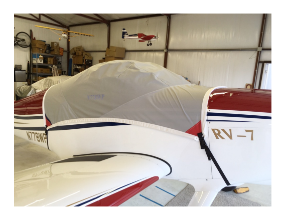
Van's RV-7 Travel Canopy Cover

occasional use outside. We also have an ultra lightweight material available for fitted hangar dust covers. For daily outdoor use, the non-travel Sunbrella Cover is the best choice.