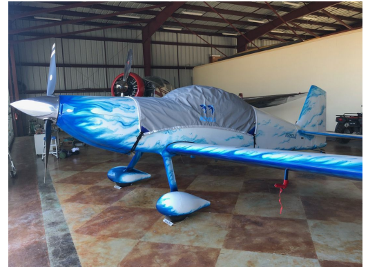
Van's RV-8 Fastback Travel Canopy Cover