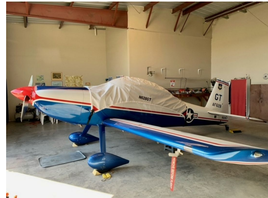
Vans RV-8 Canopy Cover