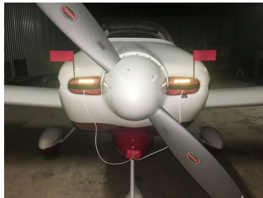
Van's Aircraft RV-7A Engine Inlet Plugs