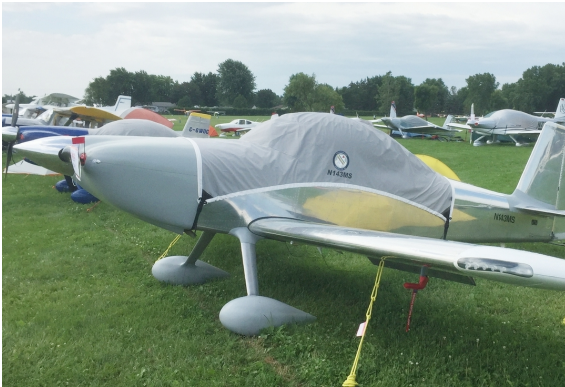
Van's Aircraft RV-8 Travel Cover, Light Weight Travel Canopy Cover

Travel Covers are made with Silver Solution-Dyed Polyester fabric and only lined over the windshield to save weight. The material is lightweight and more compact for easy stowage in the aircraft. The polyester material is water resistant, but only intended for occasional use outside. We also have an ultra lightweight material available for fitted hangar dust covers. For daily outdoor use, the non-travel Sunbrella Cover is the best choice.