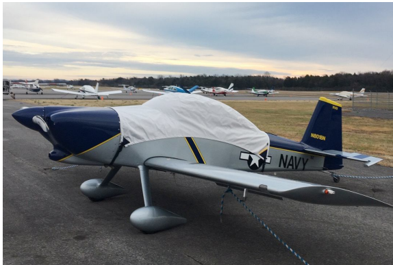
Van's RV-8 Canopy Cover

This cover type is made from Silver Acrylic Sunbrella canvas and is 100% lined with a soft and smooth microfiber. Bruce's Custom Covers developed this material combination especially for aircraft protection. The outer material is medium weight and treated for water resistance, UV resistance and anti-static buildup. The inner lining is a very soft and smooth microfiber to prevent scratching. The material is very reflective, and tests show that the cabin interior temperature can be reduced to near-ambient temperature on the hottest of days. It is water, ice and snow repellent, yet breathable to allow moisture to escape from between the cover and the aircraft surface.