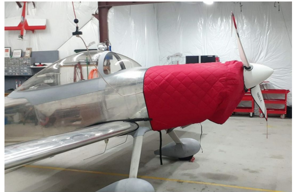
Van's Aircraft RV-8/8A Insulated Hangar Blanket, Interior Use