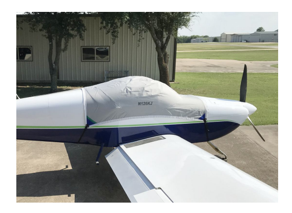
Van's RV-9A Travel Weight Canopy Cover

Travel Covers are made with Silver Solution-Dyed Polyester fabric and only lined over the windshield to save weight. The material is lightweight and more compact for easy stowage in the aircraft. The polyester material is water resistant, but only intended for occasional use outside. We also have an ultra lightweight material available for fitted hangar dust covers. For daily outdoor use, the non-travel Sunbrella Cover is the best choice.