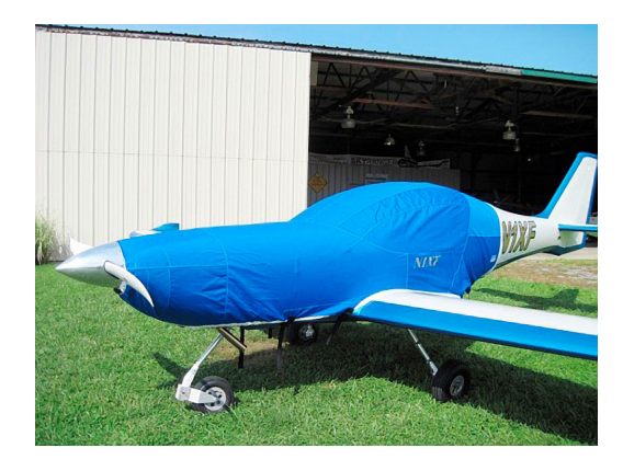
Arion Lightning Extended Canopy/Engine Cover

This cover type is made from Silver Acrylic Sunbrella canvas and is 100% lined with a soft and smooth microfiber. Bruce's Custom Covers developed this material combination especially for aircraft protection. The outer material is medium weight and treated for water resistance, UV resistance and anti-static buildup. The inner lining is a very soft and smooth microfiber to prevent scratching. The material is very reflective, and tests show that the cabin interior temperature can be reduced to near-ambient temperature on the hottest of days. It is water, ice and snow repellent, yet breathable to allow moisture to escape from between the cover and the aircraft surface.