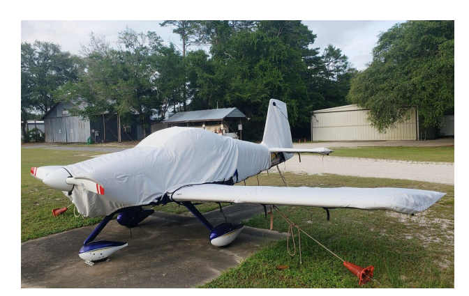
Van's RV-7A Cover Set

WINTER USE MATERIAL - Made with Solution-Dyed Polyester fabric, this option is intended for seasonal use to aid in deicing, rain mitigation, or for occasional travel. The material is lighter and more compact, but more susceptible to UV damage and may have a shorter useful life if used continuously outside than the all-year use material.