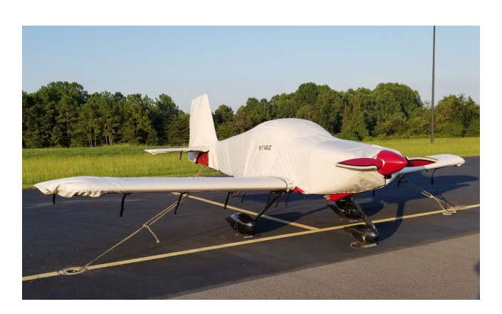
Van's RV-7A Complete Cover Set