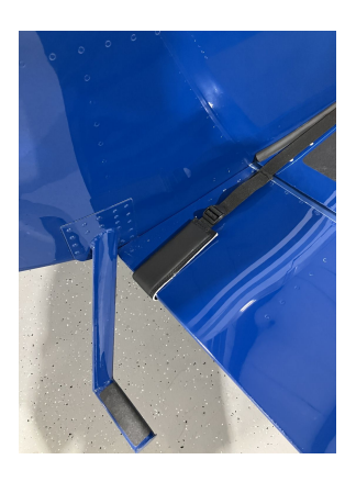
Van's Aircraft RV-7A Insulated Engine Cover