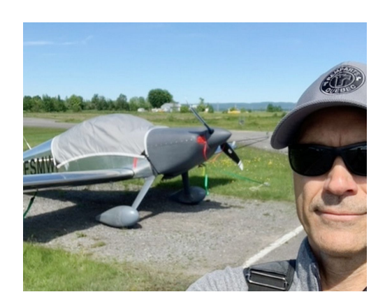
Van's RV-7 Travel Cover, Light Weight Canopy Cover