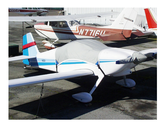
Vans's RV-6 Canopy Cover, Prop Cover