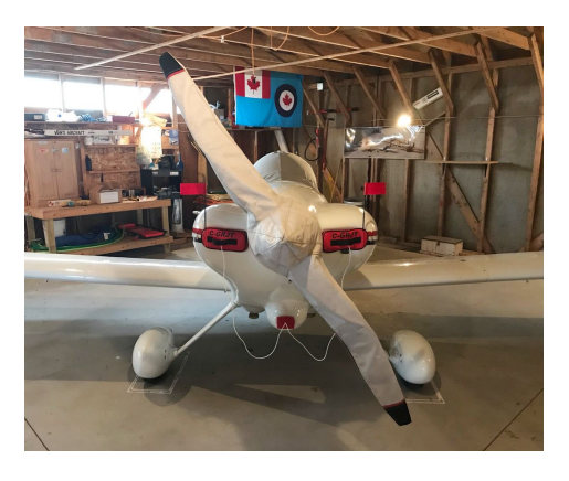
Van's RV-4 Prop Cover, Engine Inlet Plugs