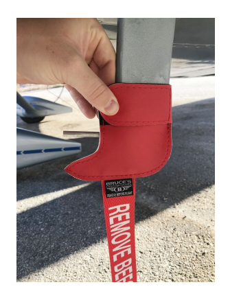
Van's RV-4 Custom Pitot Tube

Engine Inlet Plugs are custom fit for your Van's Aircraft RV-4 intakes, made with heavy-duty vinyl material, and stuffed with a single block of sculpted urethane foam. Each plug has a zipper that allows the foam to be removed and dried if necessary. Engine plugs have warning flags that are visible from the cockpit or 'remove before flight' streamers sewn onto the face of the plugs. Most plugs are imprinted with the aircraft registration number in black for an extra charge. Storage bag NOT included. Engine plugs may be inserted after flight when the engine is still warm. Engine Inlet Plugs are commonly referred to as Cowl Plugs, Intake Plugs, Cowl Blocks, Engine Blocks, and Engine Bungs.