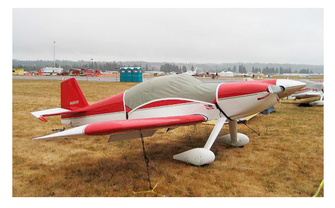
Harmon Rocket Canopy Cover & Engine Inlet Plugs

Travel Covers are made with Silver Solution-Dyed Polyester fabric and only lined over the windshield to save weight. The material is lightweight and more compact for easy stowage in the aircraft. The polyester material is water resistant, but only intended for occasional use outside. We also have an ultra lightweight material available for fitted hangar dust covers. For daily outdoor use, the non-travel Sunbrella Cover is the best choice.