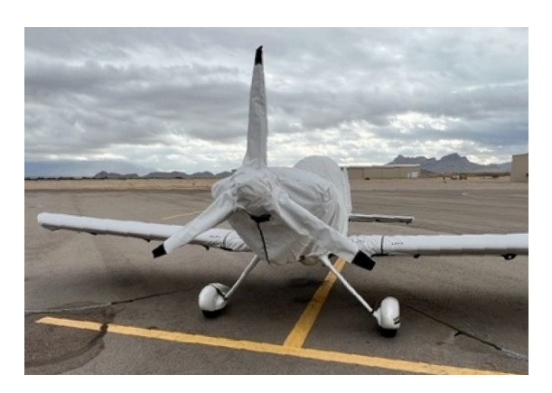
Vans RV-8 Prop Cover, 3-Blade Type