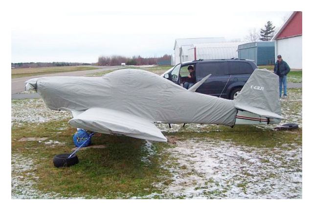
Van's RV-4 Complete Fuselage/Wing/Tail Surfaces cover

This cover type is made from Silver Acrylic Sunbrella canvas and is 100% lined with a soft and smooth microfiber. Bruce's Custom Covers developed this material combination especially for aircraft protection. The outer material is medium weight and treated for water resistance, UV resistance and anti-static buildup. The inner lining is a very soft and smooth microfiber to prevent scratching. The material is very reflective, and tests show that the cabin interior temperature can be reduced to near-ambient temperature on the hottest of days. It is water, ice and snow repellent, yet breathable to allow moisture to escape from between the cover and the aircraft surface.