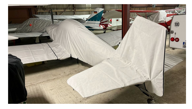
Van's Aircraft RV-4 Complete Fuselage Cover W/Detachable Wing Covers