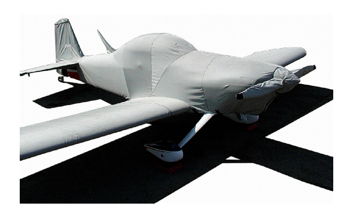
Van's RV-4 Complete Cover