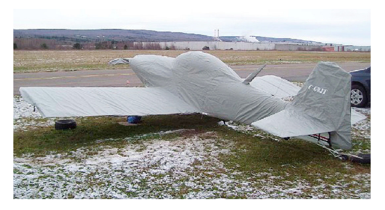
Van's RV-4 Complete Fuselage/Wing/Tail Surfaces cover