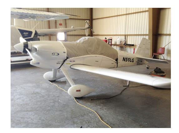
Van's RV-3 Light Weight Travel Cover

Travel Covers are made with Silver Solution-Dyed Polyester fabric and only lined over the windshield to save weight. The material is lightweight and more compact for easy stowage in the aircraft. The polyester material is water resistant, but only intended for occasional use outside. We also have an ultra lightweight material available for fitted hangar dust covers. For daily outdoor use, the non-travel Sunbrella Cover is the best choice.