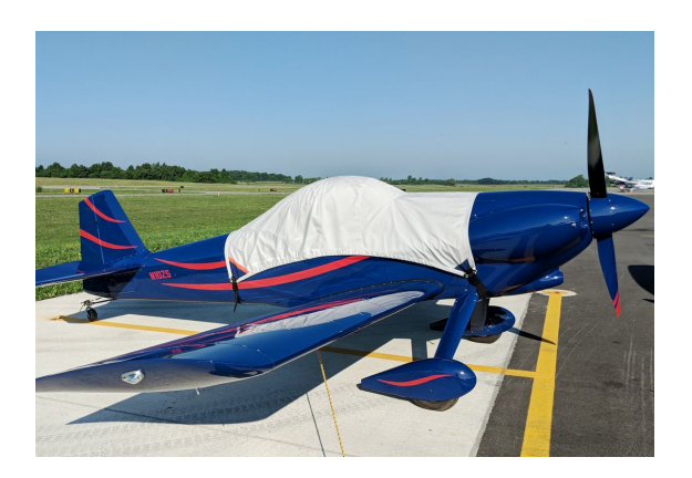
Van's RV-3 Canopy Cover

This cover type is made from Silver Acrylic Sunbrella canvas and is 100% lined with a soft and smooth microfiber. Bruce's Custom Covers developed this material combination especially for aircraft protection. The outer material is medium weight and treated for water resistance, UV resistance and anti-static buildup. The inner lining is a very soft and smooth microfiber to prevent scratching. The material is very reflective, and tests show that the cabin interior temperature can be reduced to near-ambient temperature on the hottest of days. It is water, ice and snow repellent, yet breathable to allow moisture to escape from between the cover and the aircraft surface.