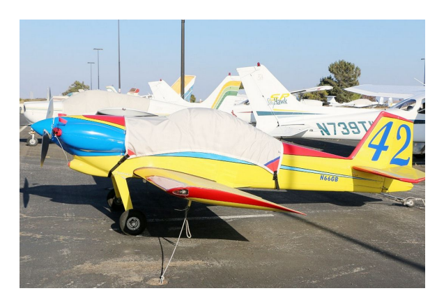
Van's RV-3 Canopy Cover and Engine Plugs