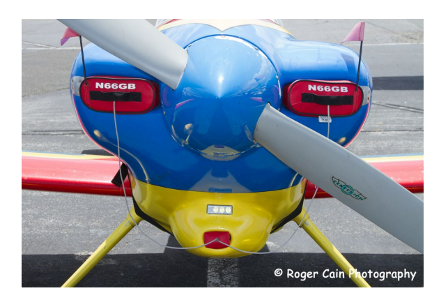
Van's RV-3 Engine Plugs