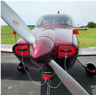
RV-10 Engine Inlet Plugs

Engine Inlet Plugs are custom fit for your Van's Aircraft RV-10 intakes, made with heavy-duty vinyl material, and stuffed with a single block of sculpted urethane foam. Each plug has a zipper that allows the foam to be removed and dried if necessary. Engine plugs have warning flags that are visible from the cockpit or 'remove before flight' streamers sewn onto the face of the plugs. Most plugs are imprinted with the aircraft registration number in black for an extra charge. Storage bag NOT included. Engine plugs may be inserted after flight when the engine is still warm. Engine Inlet Plugs are commonly referred to as Cowl Plugs, Intake Plugs, Cowl Blocks, Engine Blocks, and Engine Bungs.