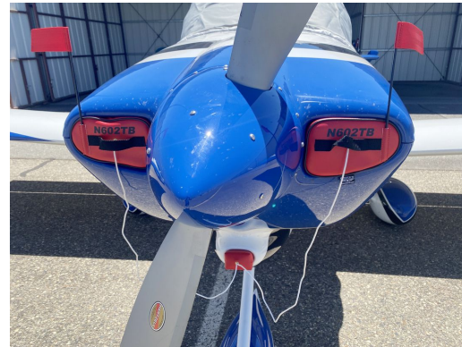
Van's RV-10 Engine Inlet Plugs