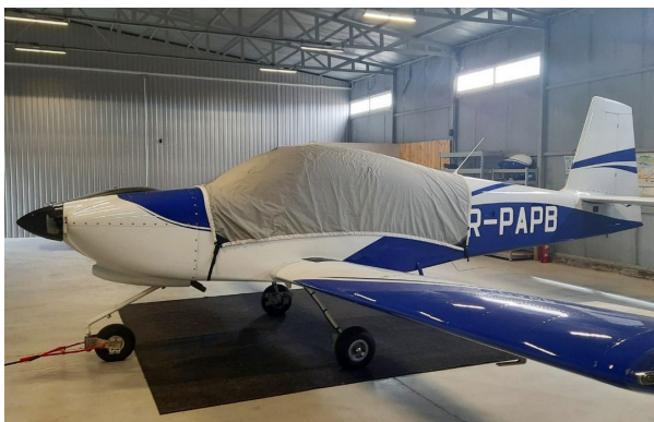
Van's RV-10 Travel Weight Canopy Cover

Travel Covers are made with Silver Solution-Dyed Polyester fabric and only lined over the windshield to save weight. The material is lightweight and more compact for easy stowage in the aircraft. The polyester material is water resistant, but only intended for occasional use outside. We also have an ultra lightweight material available for fitted hangar dust covers. For daily outdoor use, the non-travel Sunbrella Cover is the best choice.