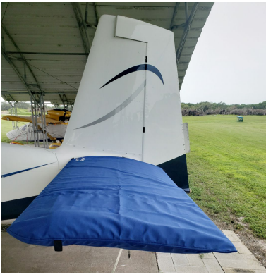
Van's RV-10 Horizontal Stabilizer Covers