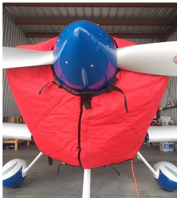
Van's RV-10 Insulated Engine Cover

This cover type is made from Silver Acrylic Sunbrella canvas and is 100% lined with a soft and smooth microfiber. Bruce's Custom Covers developed this material combination especially for aircraft protection. The outer material is medium weight and treated for water resistance, UV resistance and anti-static buildup. The inner lining is a very soft and smooth microfiber to prevent scratching. The material is very reflective, and tests show that the cabin interior temperature can be reduced to near-ambient temperature on the hottest of days. It is water, ice and snow repellent, yet breathable to allow moisture to escape from between the cover and the aircraft surface.