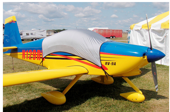
Van's RV-9A Light Weight Travel-Cover