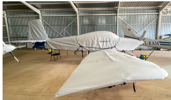
Van's RV-10 Full Cover Set