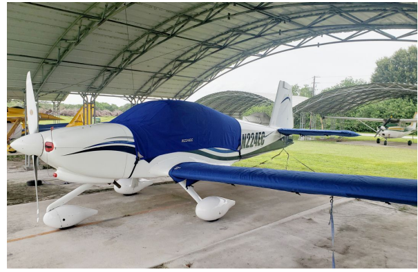
Vans's RV-10 Wing Covers