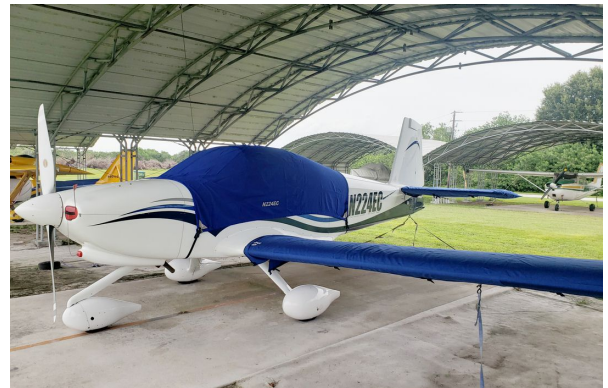
Vans's RV-10 Wing Covers