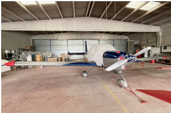
Van's RV-10 Extended Canopy Cover, Wingtip Pads, Engine Plugs

This cover type is made from Silver Acrylic Sunbrella canvas and is 100% lined with a soft and smooth microfiber. Bruce's Custom Covers developed this material combination especially for aircraft protection. The outer material is medium weight and treated for water resistance, UV resistance and anti-static buildup. The inner lining is a very soft and smooth microfiber to prevent scratching. The material is very reflective, and tests show that the cabin interior temperature can be reduced to near-ambient temperature on the hottest of days. It is water, ice and snow repellent, yet breathable to allow moisture to escape from between the cover and the aircraft surface.