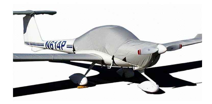
Diamond DA-20 Canopy/Engine, Wing & Horiz. Stab. Covers