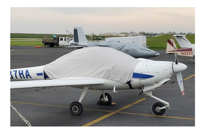
Diamond DA-20 Katana

This cover type is made from Silver Acrylic Sunbrella canvas and is 100% lined with a soft and smooth microfiber. Bruce's Custom Covers developed this material combination especially for aircraft protection. The outer material is medium weight and treated for water resistance, UV resistance and anti-static buildup. The inner lining is a very soft and smooth microfiber to prevent scratching. The material is very reflective, and tests show that the cabin interior temperature can be reduced to near-ambient temperature on the hottest of days. It is water, ice and snow repellent, yet breathable to allow moisture to escape from between the cover and the aircraft surface.