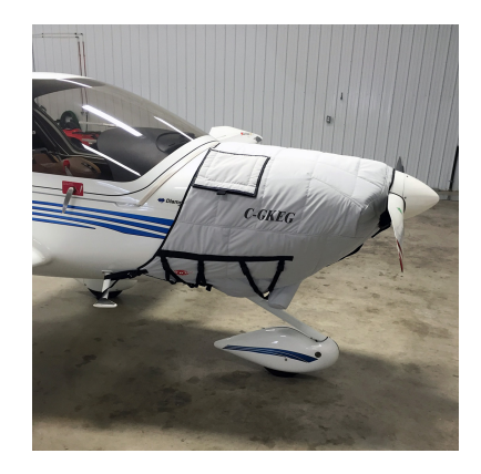
Diamond DA-20-C1 Insulated Engine Cover

This cover type is made from Silver Acrylic Sunbrella canvas and is 100% lined with a soft and smooth microfiber. Bruce's Custom Covers developed this material combination especially for aircraft protection. The outer material is medium weight and treated for water resistance, UV resistance and anti-static buildup. The inner lining is a very soft and smooth microfiber to prevent scratching. The material is very reflective, and tests show that the cabin interior temperature can be reduced to near-ambient temperature on the hottest of days. It is water, ice and snow repellent, yet breathable to allow moisture to escape from between the cover and the aircraft surface.