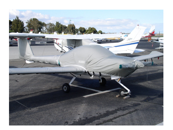
DA-20 Full Cover Set