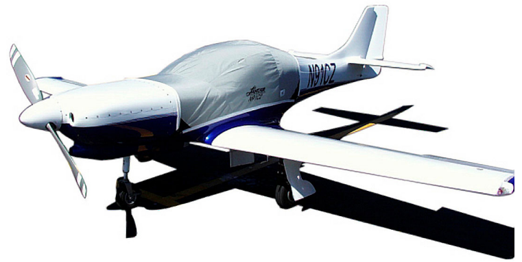
Canopy Cover for Lancair 320/360