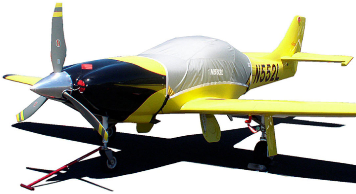
Canopy Cover for Lancair Legacy