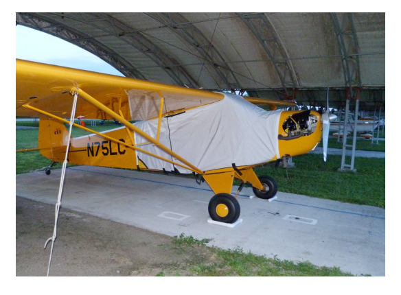
Rans S-7 Courier Canopy Cover (Over-The-Top Style), Belly Strap Type, Lsa Model (S7-S)