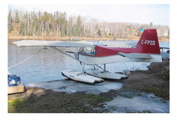
Rans S-7 Insulated Engine Cover, Wing Covers and Horizontal Stabilizer Covers

WINTER USE MATERIAL - Made with Solution-Dyed Polyester fabric, this option is intended for seasonal use to aid in deicing, rain mitigation, or for occasional travel. The material is lighter and more compact, but more susceptible to UV damage and may have a shorter useful life if used continuously outside than the all-year use material.