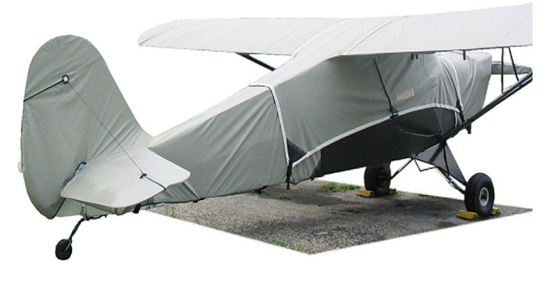
Taylorcraft L-2 Grasshopper Prop, Engine, Canopy, Wing and Empennage Covers