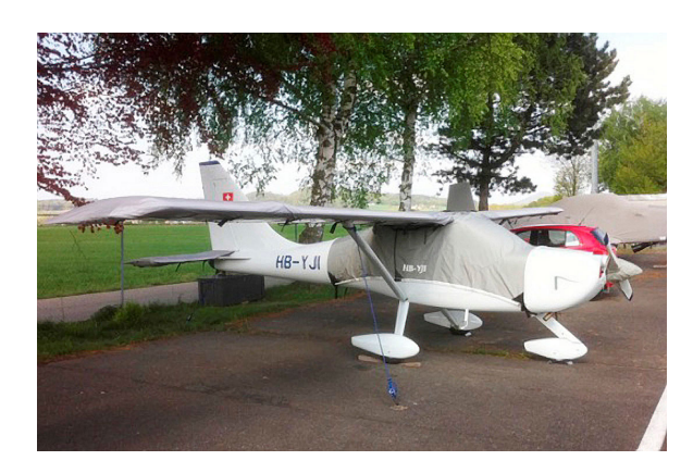
OMF Symphony Canopy, Wings, Horiz. Stab, and Prop Covers