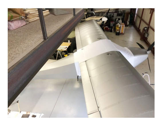
Rans S-20 Raven Travel Cover, Light Weight Travel Canopy Cover