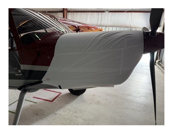
Rans S-21 Engine Cover, test fit cover

the hottest of days. It is water, ice and snow repellent, yet breathable to allow moisture to escape from between the cover and the aircraft surface.