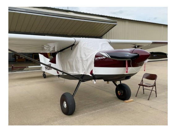
Rans S-21 Over The Top Canopy Cover