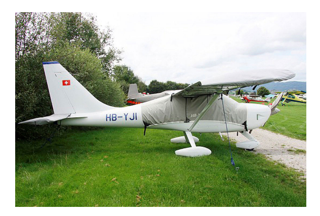
Glastar Canopy, Wings, Horizontal Stab. & Prop Covers