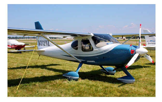
Glastar Sportsman Engine Inlet Plugs

Engine Inlet Plugs are custom fit for your Rans S-21 Outbound intakes, made with heavy-duty vinyl material, and stuffed with a single block of sculpted urethane foam. Each plug has a zipper that allows the foam to be removed and dried if necessary. Engine plugs have warning flags that are visible from the cockpit or 'remove before flight' streamers sewn onto the face of the plugs. Most plugs are imprinted with the aircraft registration number in black for an extra charge. Storage bag NOT included. Engine plugs may be inserted after flight when the engine is still warm. Engine Inlet Plugs are commonly referred to as Cowl Plugs, Intake Plugs, Cowl Blocks, Engine Blocks, and Engine Bungs.