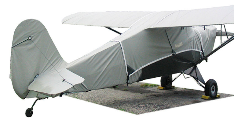
Taylorcraft L-2 Grasshopper Prop, Engine, Canopy, Wing and Empennage Covers