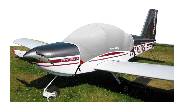
Rans S-19 Canopy Cover (illustration)