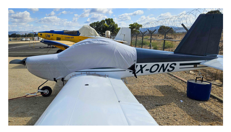
Rans S-19 Canopy/Engine Cover

This cover type is made from Silver Acrylic Sunbrella canvas and is 100% lined with a soft and smooth microfiber. Bruce's Custom Covers developed this material combination especially for aircraft protection. The outer material is medium weight and treated for water resistance, UV resistance and anti-static buildup. The inner lining is a very soft and smooth microfiber to prevent scratching. The material is very reflective, and tests show that the cabin interior temperature can be reduced to near-ambient temperature on the hottest of days. It is water, ice and snow repellent, yet breathable to allow moisture to escape from between the cover and the aircraft surface.