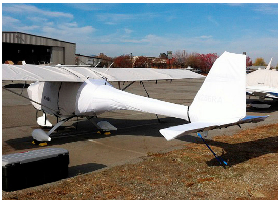
Remos Empennage Cover (test fit cover)

WINTER USE MATERIAL - Made with Solution-Dyed Polyester fabric, this option is intended for seasonal use to aid in deicing, rain mitigation, or for occasional travel. The material is lighter and more compact, but more susceptible to UV damage and may have a shorter useful life if used continuously outside than the all-year use material.