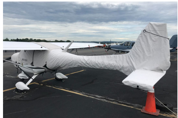
Remos G3 & GX MODELS Empennage Cover