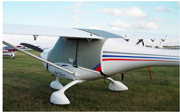
Remos G3 Travel Weight Canopy Cover