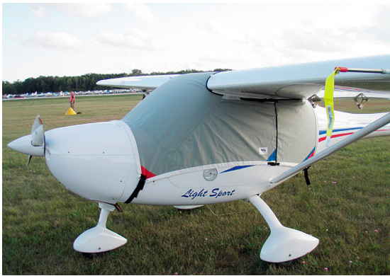
Remos G3 Travel Weight Canopy Cover

This cover type is made from Silver Acrylic Sunbrella canvas and is 100% lined with a soft and smooth microfiber. Bruce's Custom Covers developed this material combination especially for aircraft protection. The outer material is medium weight and treated for water resistance, UV resistance and anti-static buildup. The inner lining is a very soft and smooth microfiber to prevent scratching. The material is very reflective, and tests show that the cabin interior temperature can be reduced to near-ambient temperature on the hottest of days. It is water, ice and snow repellent, yet breathable to allow moisture to escape from between the cover and the aircraft surface.