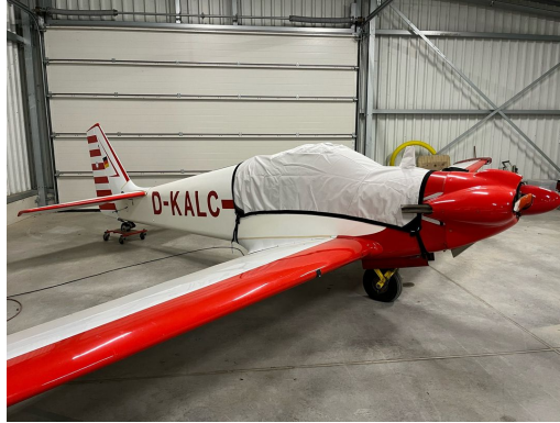
Fournier RF-4D Motorglider Canopy Cover