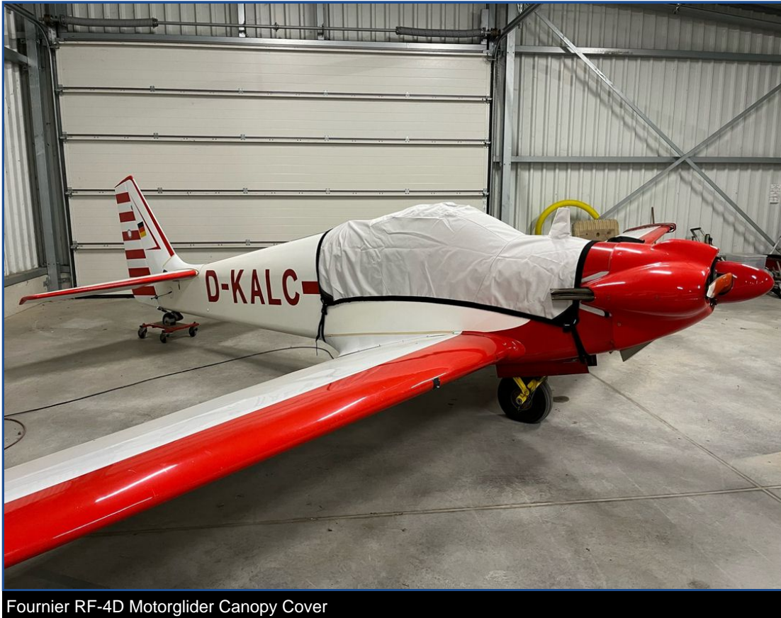
Fournier RF-4D Motorglider Canopy Cover