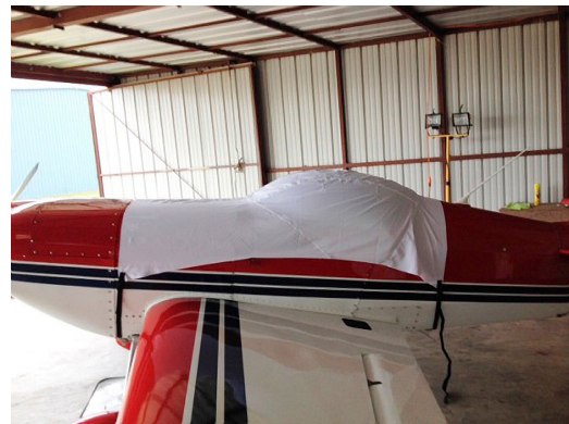
IAC One Design Canopy Cover, test fit cover