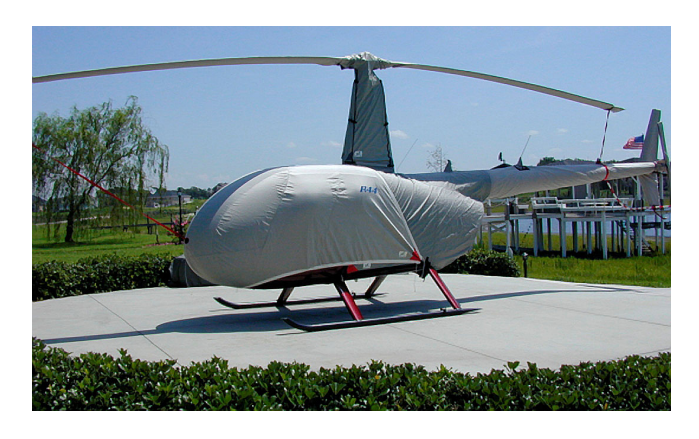
Robinson R-44 Full Cover Set