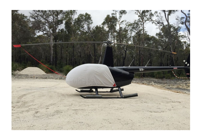
Robinson R-44 Bubble Cover and Blade Tie-Down