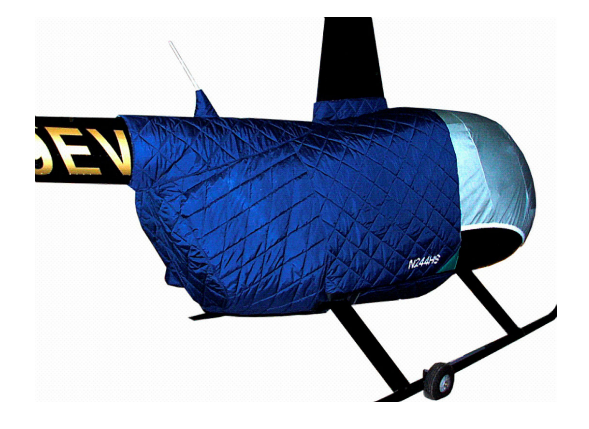
Robinson R-44 Insulated Engine Cover