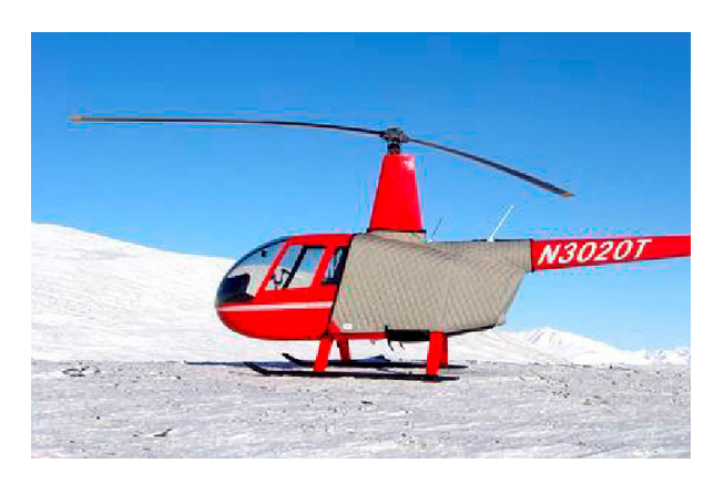
Robinson R-44 Insulated Engine Cover

WINTER USE MATERIAL - Made with Solution-Dyed Polyester fabric, this option is intended for seasonal use to aid in deicing, rain mitigation, or for occasional travel. The material is lighter and more compact, but more susceptible to UV damage and may have a shorter useful life if used continuously outside than the all-year use material.