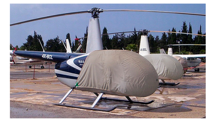
Robinson R-44 Bubble Cover