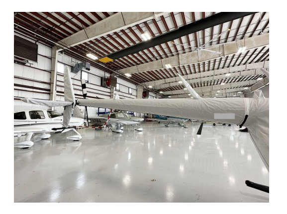
Robinson R-66 Tailboom & Tailfin Cover