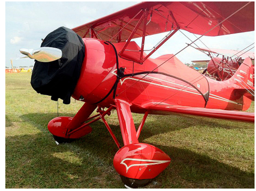
Waco UPF-7 Canopy & Engine Cover