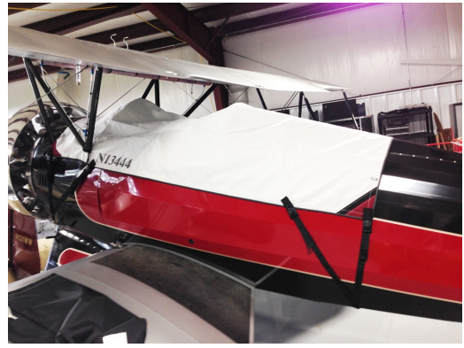
Waco QCF/UBF Canopy Cover