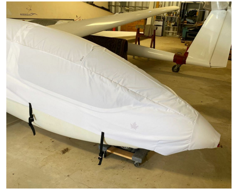
PZL Swidnik PW6 Canopy/Nose Cover