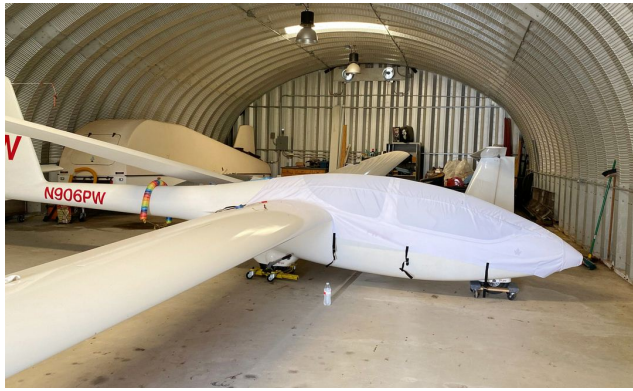
PZL Swidnik PW6 Canopy/Nose Cover