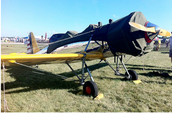
Ryan PT-22 Canopy Cover and Engine Cover

water resistance, UV resistance and anti-static buildup. The inner lining is a very soft and smooth microfiber to prevent scratching. The material is very reflective, and tests show that the cabin interior temperature can be reduced to near-ambient temperature on the hottest of days. It is water, ice and snow repellent, yet breathable to allow moisture to escape from between the cover and the aircraft surface.