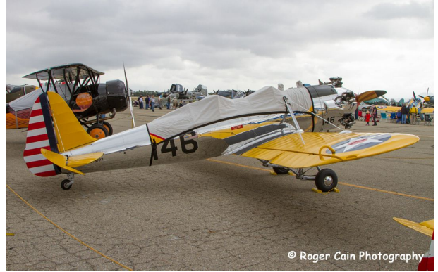
Ryan PT-22 Canopy Cover