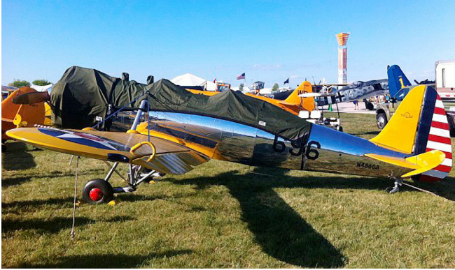
Ryan PT-22 ST3KR Canopy Cover and Engine Cover

This cover type is made from Silver Acrylic Sunbrella canvas and is 100% lined with a soft and smooth microfiber. Bruce's Custom Covers developed this material combination especially for aircraft protection. The outer material is medium weight and treated for water resistance, UV resistance and anti-static buildup. The inner lining is a very soft and smooth microfiber to prevent scratching. The material is very reflective, and tests show that the cabin interior temperature can be reduced to near-ambient temperature on the hottest of days. It is water, ice and snow repellent, yet breathable to allow moisture to escape from between the cover and the aircraft surface.