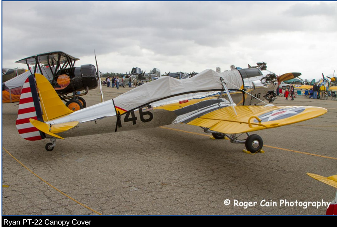
Ryan PT-22 Canopy Cover