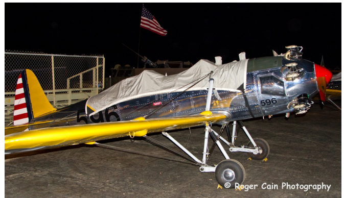
Ryan PT-22 Canopy Cover