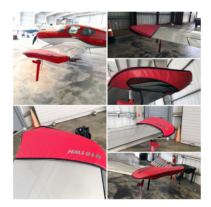
Cirrus SR22 Wingtip Pads, G5 Models

Designed to prevent damage to the aircraft extremities in crowded hangars, these products are made of bright red Naugahyde and thickly padded with a sandwich of closed cell foam.