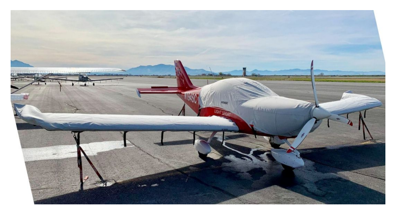
Czech Sport Canopy/Engine & Wing Covers

This cover type is made from Silver Acrylic Sunbrella canvas and is 100% lined with a soft and smooth microfiber. Bruce's Custom Covers developed this material combination especially for aircraft protection. The outer material is medium weight and treated for water resistance, UV resistance and anti-static buildup. The inner lining is a very soft and smooth microfiber to prevent scratching. The material is very reflective, and tests show that the cabin interior temperature can be reduced to near-ambient temperature on the hottest of days. It is water, ice and snow repellent, yet breathable to allow moisture to escape from between the cover and the aircraft surface.