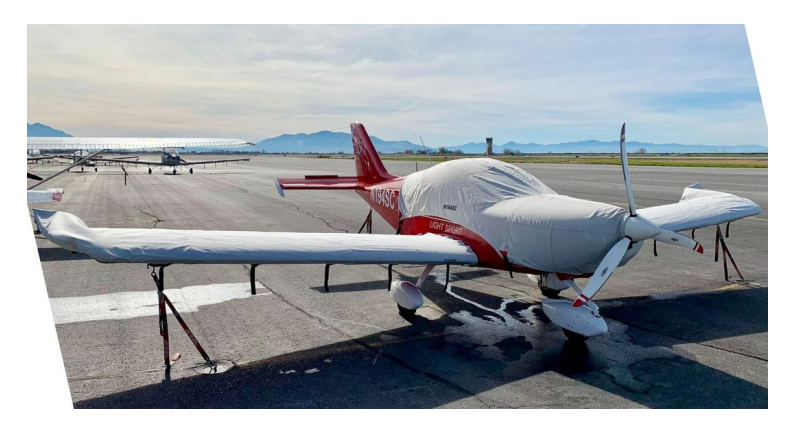
Czech Sport Canopy/Engine & Wing Covers

WINTER USE MATERIAL - Made with Solution-Dyed Polyester fabric, this option is intended for seasonal use to aid in deicing, rain mitigation, or for occasional travel. The material is lighter and more compact, but more susceptible to UV damage and may have a shorter useful life if used continuously outside than the all-year use material.