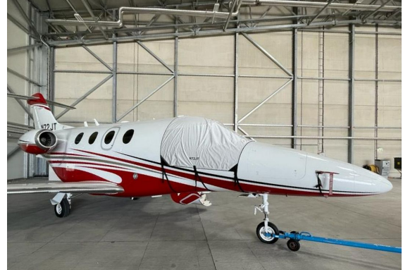
Hawker Premier Cockpit Cover