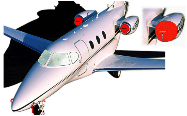
Premier Intake Plugs, Intake Covers, Pitot Covers & Cockpit HeatShields