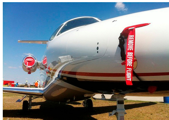
Premier Heat Resistant Pitot Covers set & Engine Intake Plugs