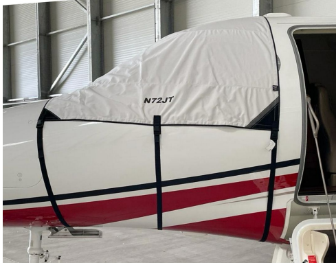
Hawker Premier Cockpit Cover

This cover type is made from Silver Acrylic Sunbrella canvas and is 100% lined with a soft and smooth microfiber. Bruce's Custom Covers developed this material combination especially for aircraft protection. The outer material is medium weight and treated for water resistance, UV resistance and anti-static buildup. The inner lining is a very soft and smooth microfiber to prevent scratching. The material is very reflective, and tests show that the cabin interior temperature can be reduced to near-ambient temperature on the hottest of days. It is water, ice and snow repellent, yet breathable to allow moisture to escape from between the cover and the aircraft surface.