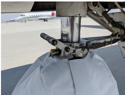
CJ1 Nose Gear Tire Cover, test fit

ALL-YEAR USE MATERIAL - Made with Silver Acrylic Sunbrella canvas, the all-year use material is the best option for sun protection and cover longevity. This heavier more durable material is intended for all weather conditions, such as rain and snow or lots of sun.