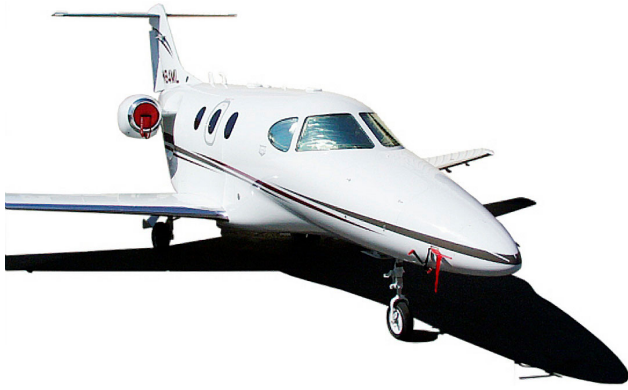
Raytheon Premier Intake Plugs, Pitot Covers & Cockpit HeatShields