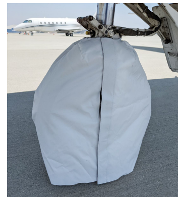
CJ1 Nose Gear Tire Cover, test fit