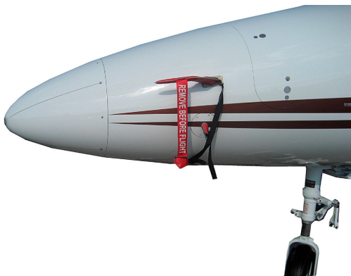
Premier Pitot, AOA, Rosemount Cover Set

The Hawker Beechcraft Premier 390 Intake/Exhaust Plugs are custom fit for the intake and exhaust openings, made with heavy-duty vinyl material, and stuffed with a single block of sculpted urethane foam. Each plug has a zipper that allows the foam to be removed and dried if necessary. Engine plugs have 'remove before flight' streamers sewn onto the face of the plugs. Most plugs are imprinted with the aircraft registration number in black. Engine plugs may be inserted after flight when the engine is still warm. Engine Inlet Plugs are commonly referred to as Cowl Plugs, Intake Plugs, Cowl Blocks, Engine Blocks, and Engine Bungs.