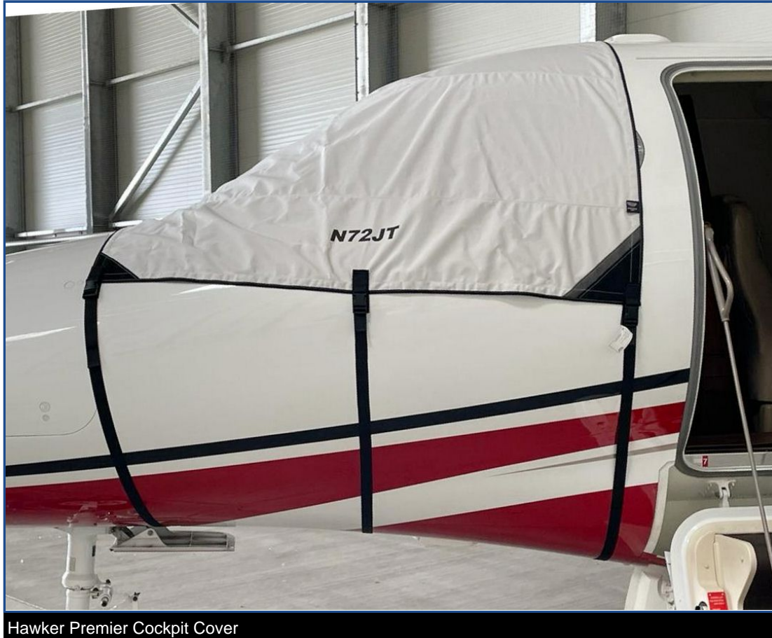
Hawker Premier Cockpit Cover